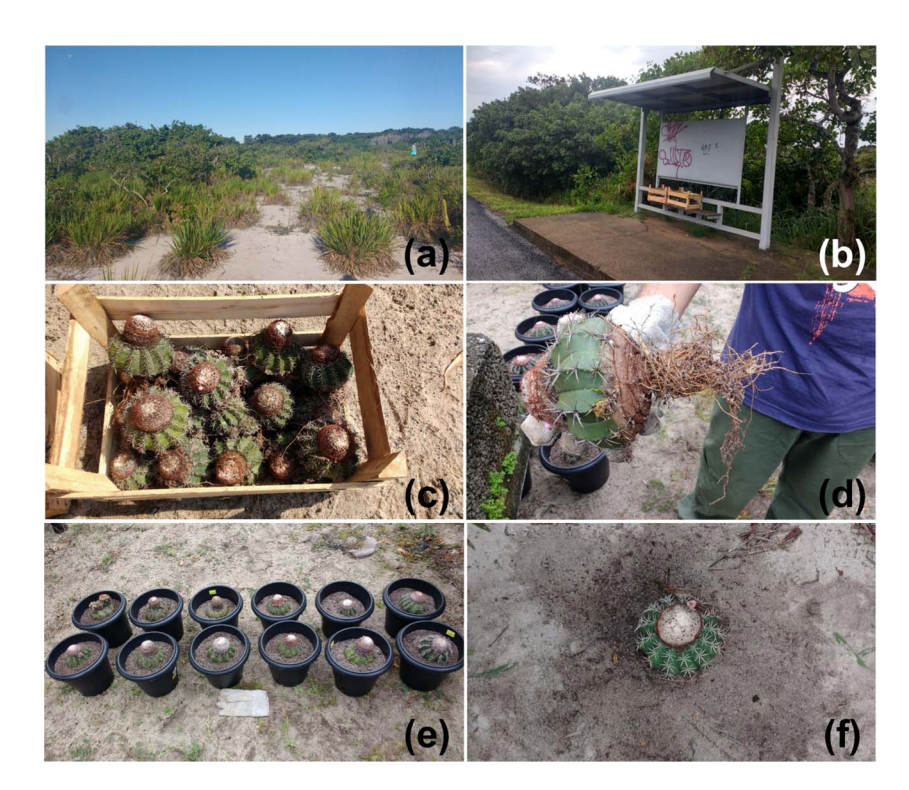
PLATE 1 (a) Natural habitat of Melocactus violaceus in restinga, (b) location where the seizure was made, (c) seized individuals bundled inside a box, (d) roots tied to facilitate commercialization, (e) individuals cultivated in the greenhouse, and (f) individual reintroduced into the wild.

up to 30 cm from the borders of thickets, which, according to field observations and the literature (Hughes et al., 2016), is the environment in which the species normally occurs. To accommodate the roots, a hole 6–12 cm deep was dug, depending on the length of the individual plant's roots. If the roots were tangled, they were untangled and planted in the containers (Plate 1e) or soil (Plate 1f), and then abundantly watered.