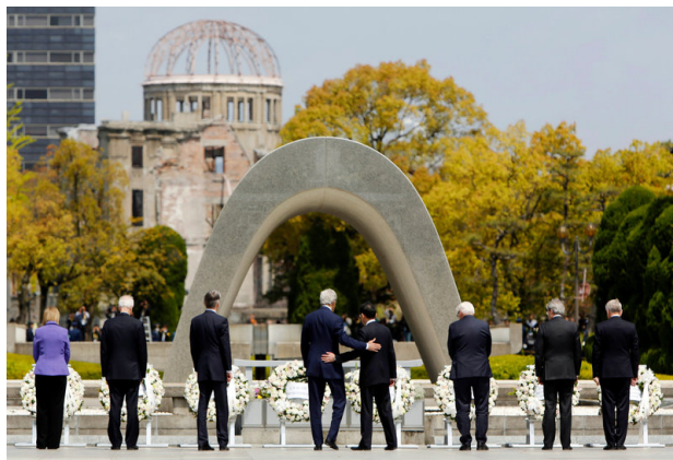
John Kerry and Kishida Fumio at Peace Memorial Park in Hiroshima, 11 April

There are mounting hopes that Barack Obama will use the occasion of the Group of 7 meeting in Japan in May to visit Hiroshima, and become the first American president to do so. It is remarkable that it required a wait of over 60 years until John Kerry became the first high American official to make such a visit, which he termed 'gut-wrenching,' while at the same time purposely refraining from offering any kind of apology to the Japanese people for one of the worse acts of state terror against a defenseless population in all of human history. Let's hope that Obama goes, and displays more remorse than Kerry who at least deserves some credit for paving the way. The contrast between the many pilgrimages of homage by Western leaders, including those of Germany, to Auschwitz and other notorious death camps, and the absence of comparable pilgrimages to Hiroshima and Nagasaki underscores the difference between winning and losing a major war. This contrast cannot be properly accounted for by insisting on a hierarchy of evils that the Holocaust dominates.