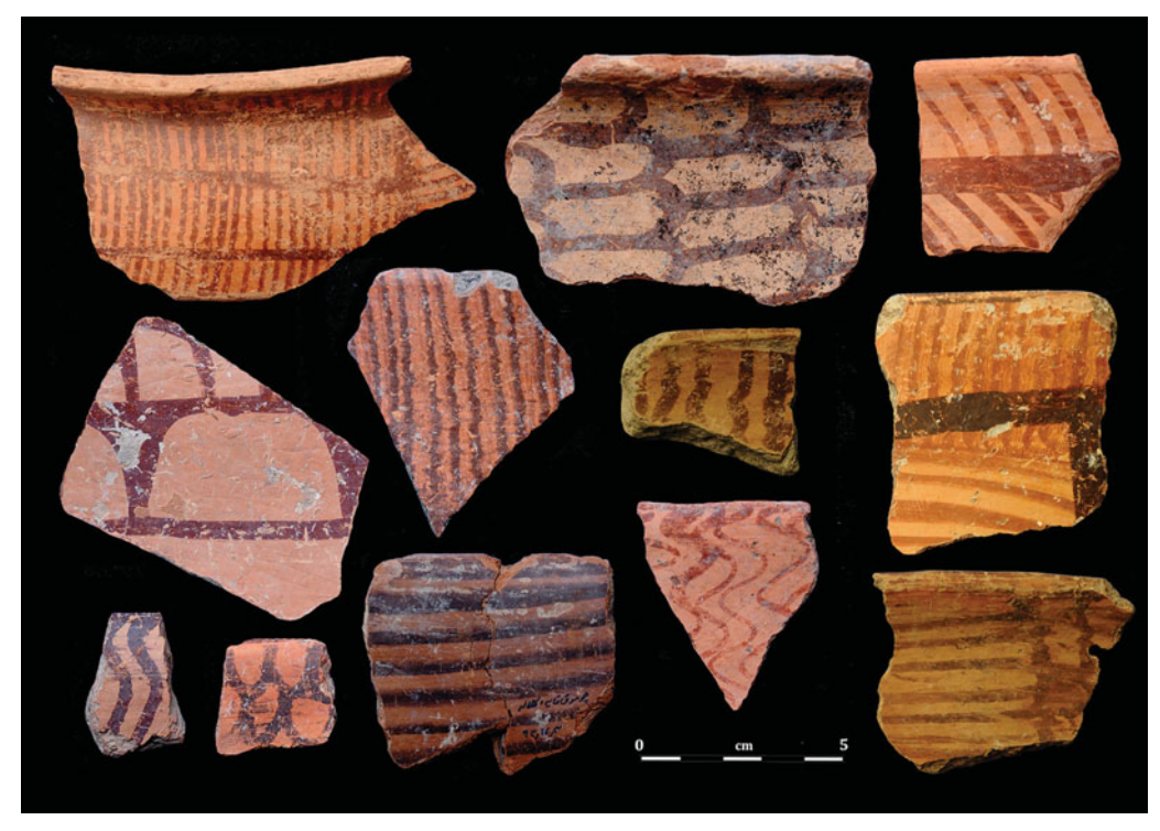
Figure 2. A selection of typical Neolithic ceramics from various sites of the Gorgan Plain.

to identify 10 new sites that were visited but not reported by our colleagues in the local Cultural Heritage offices.