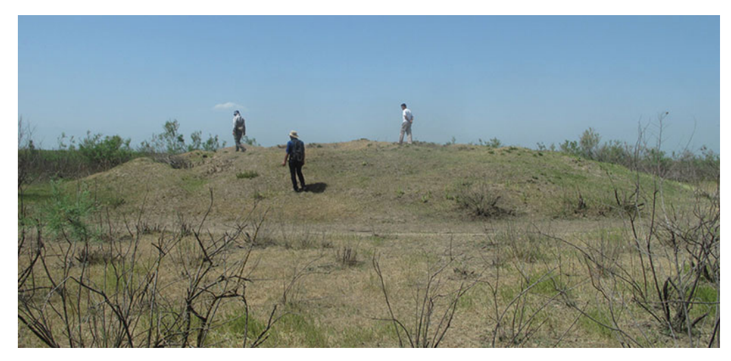
Figure 5. An example of a single-period mounded site.

As discussed in detail elsewhere (e.g. Roustaei 2014, 2016a; Roustaei et al. 2015), the emerging picture of the Neolithic of north-east Iran can also contribute to a better understanding of the Neolithic of southern Turkmenistan: the 'Jeitun Culture'. Finally, as well as links with the regions to the west and north, this almost unparalleled concentration of late seventh- to sixth-millennium BC sites on a comparatively small plain to the east of the Zagros Mountains (although see Sumner 1990: tab. 2) has important implications for varied environmental, subsistence, demographic and social aspects of our reconstruction of the Neolithic societies of Iran.