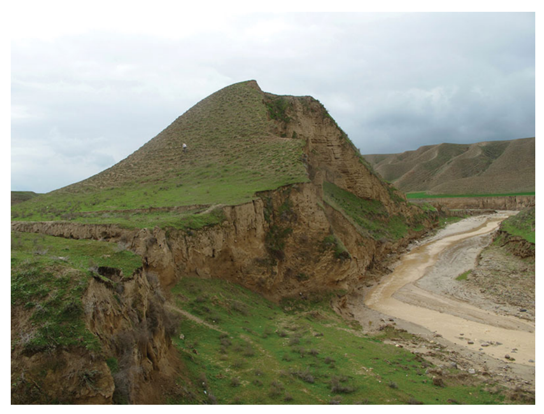
Figure 4. A typical, multi-period mounded site, partly washed away by the Sarisou River.