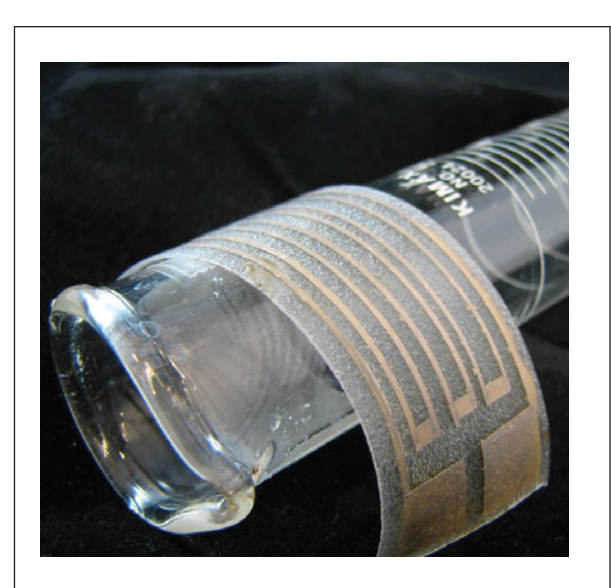
Reactive silver ink is airbrushed onto a thin, stretchy plastic film to make a flexible silver electrode.