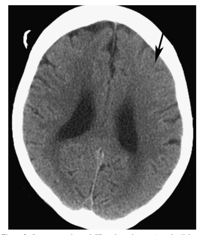
Figure 2: Repeat nonenhanced CT performed approximately 48 hours after the dual-energy head CT demonstrates complete resolution of the gyriform high attenuation in the left frontal lobe.