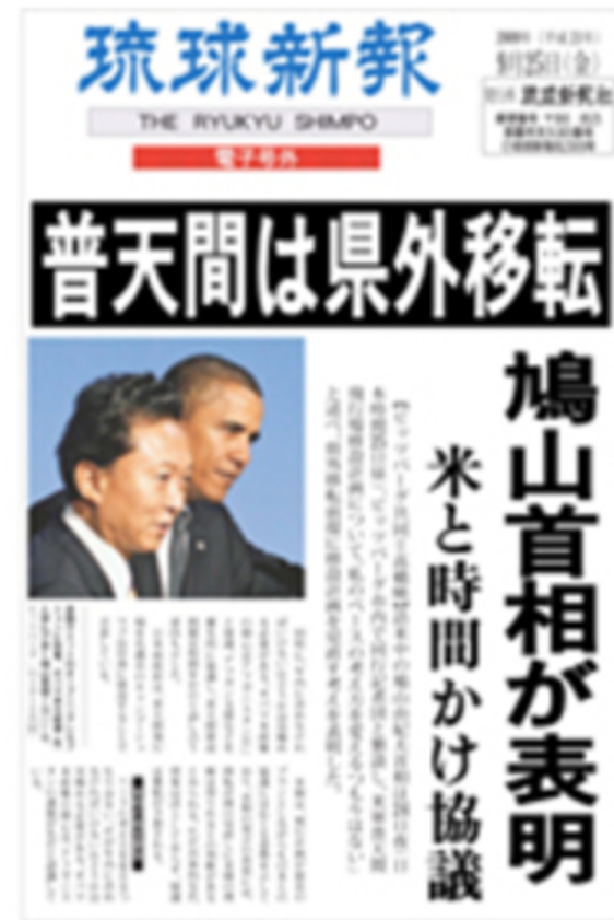
Hatoyama informs Obama of the Kengai Isetsu Policy

Hatoyama’s proposition instantaneously thrust kengai isetsu as an intelligible political claim into public consciousness. Which governor of a Japanese prefecture, he asked, was willing to accept a US military base in place of Okinawa? 16 Due to the disproportionately small number of US military bases in Japanese prefectures other than Okinawa, few Japanese politicians or citizens had directly confronted the meaning of the US-Japan Security Treaty. However, with Hatoyama effectively dropping the base problem on each governor’s doorstep, many citizens were forced to confront the reality of the Treaty from which they benefit. Are you willing to pay dues for the US-Japan Security Treaty rather than continuing to exploit Okinawa Prefecture by imposing 75% of the burden there?