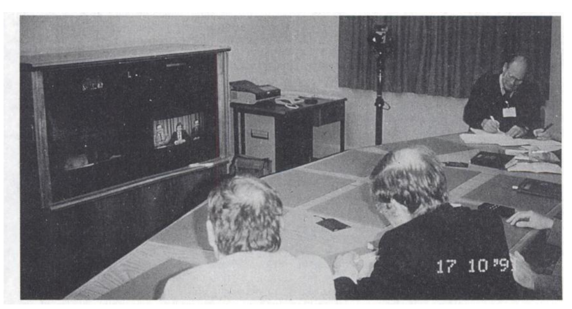
A televideo department meeting.

In 1989 UWCM set up an Academic Subdepartment of Psychological Medicine at the North Wales Hospital in Denbigh with the active support of