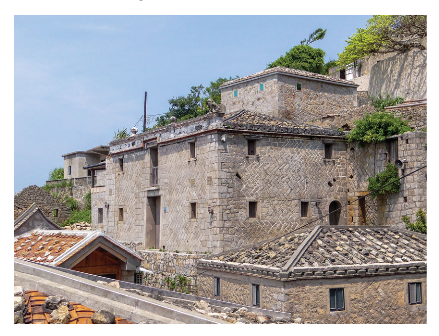
Fig. 1.1 Pirate house

My ancestors moved from Heshang to Beigan, And lodged above Qinbi called himself Banshan.