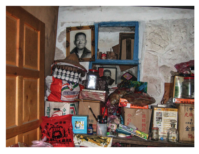
Fig. 1.3 Ancestral tablets and photos in a house