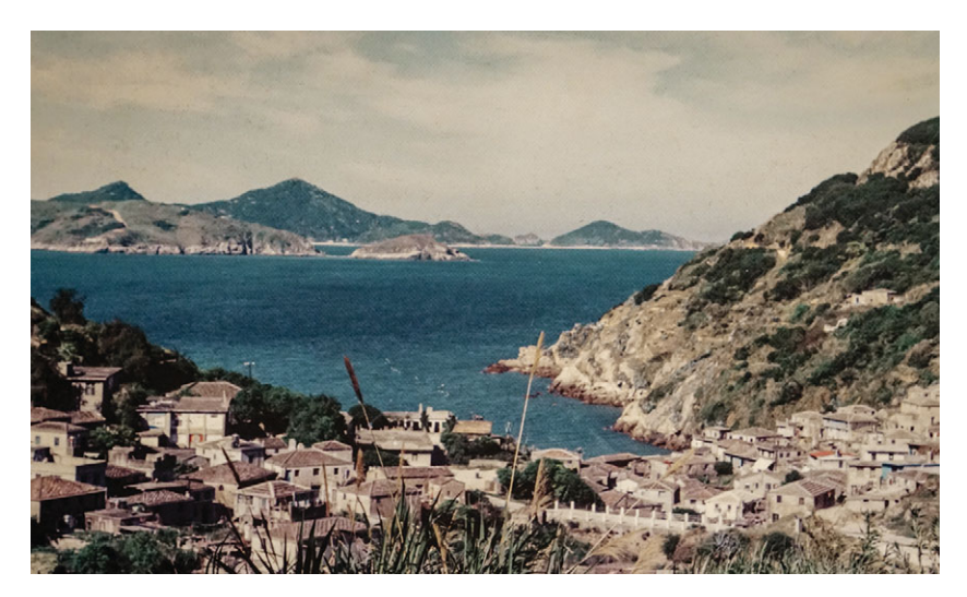
Fig. 1.2 Ox Horn surrounds the inlet and spreads uphill (Photo by Yang Suisheng, approximately 1986)

unpredictable and dangerous and the threat of disaster loomed large; shipwrecks were relatively common. When a fisherman did not return, the entire responsibility for the family fell on the shoulders of his widow. There is a saying in Matsu to the effect that "a wife (or a mother) is a bucket hoop (F. Lauma/ nuongne sei thoeyngkhu)." The analogy drawn between a bucket hoop that encircles the bucket to prevent the staves from falling apart and the role of a mother who holds the family together, protecting the children from destitution, is an apt one. 17 If only one family member is to survive most "would rather that the mother lives" (F. gangnguong si nuongma, me a si nuongne). Nonetheless, the hardships endured by widowed mothers and fatherless children were almost unbearable in these barren islands, and thus the Matsu people also practiced a special kind of marriage arrangement in which a man came into the family of a widow (F. suongmuong). His responsibility was to support the family and to take care of the children left by the deceased husband. This allowed the children to receive good care, instead of becoming "a burden as children-in-law" (tuoyou ping). The rewards flowed both ways: the man entering a widow's family earned respect