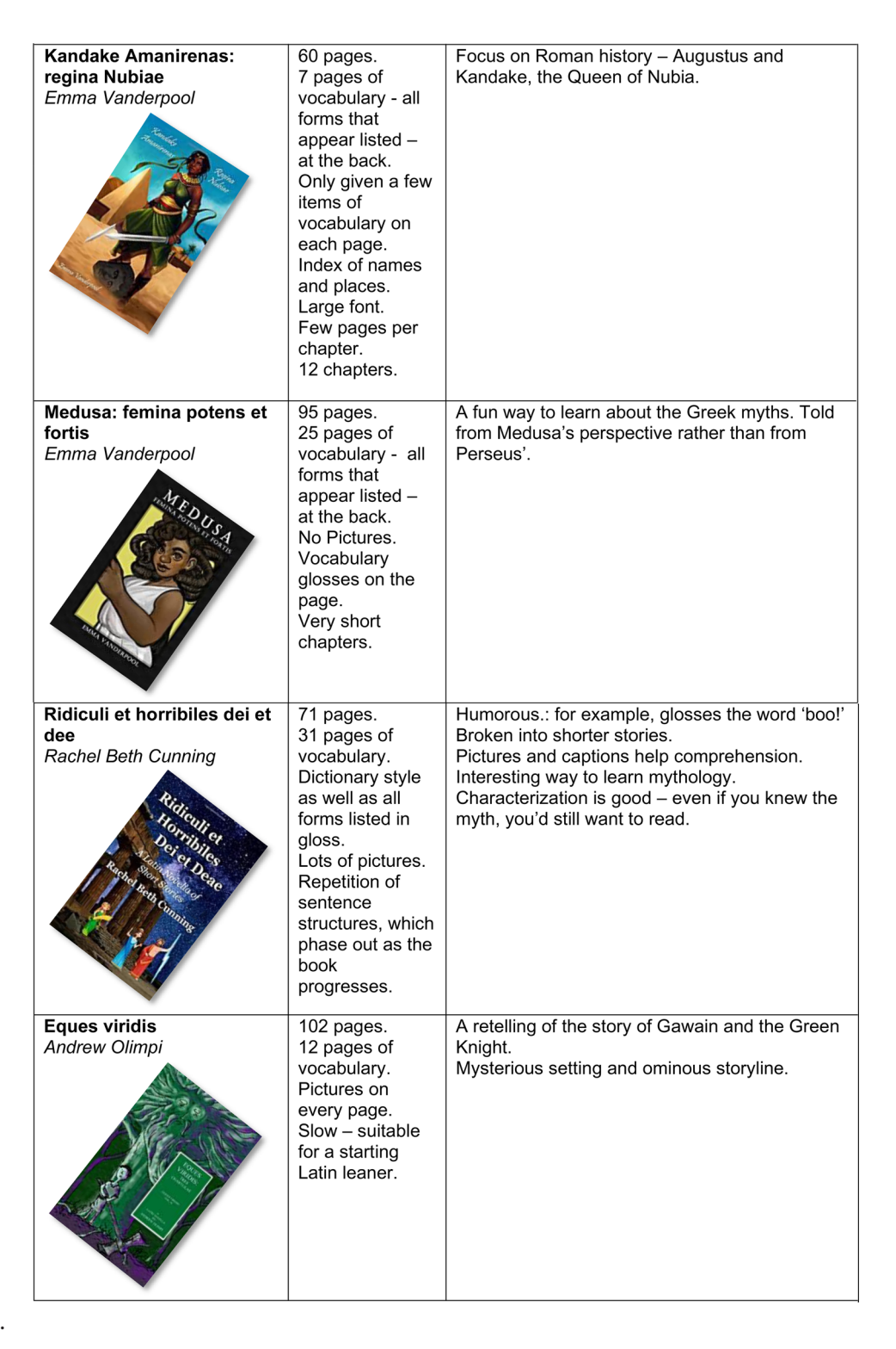
Figure 2 (Continued).

Pennac's (2006) Rights of the Reader are worth recalling here to help remnind teachers what reading for pleasure might entail: