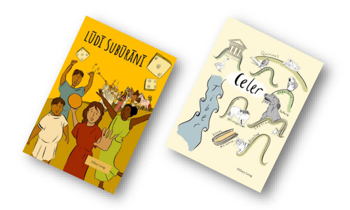
Figure 1. Two spinoff novellas from the Latin coursebook Suburani.

Institutional accountability, as always, makes its presence strongly felt. For institutional 'buy-in' the new Latin coursebook Suburani (Hands-Up Education, 2020) has published two short novellas based around characters from its own storyline: Celer (Long, 2021a) and Ludi Suburani (Long, 2021b) (Figure 1). Perhaps such spinoffs could provide the necessary validation in the eyes of senior management at the same time as providing an opportunity for some pleasure reading.