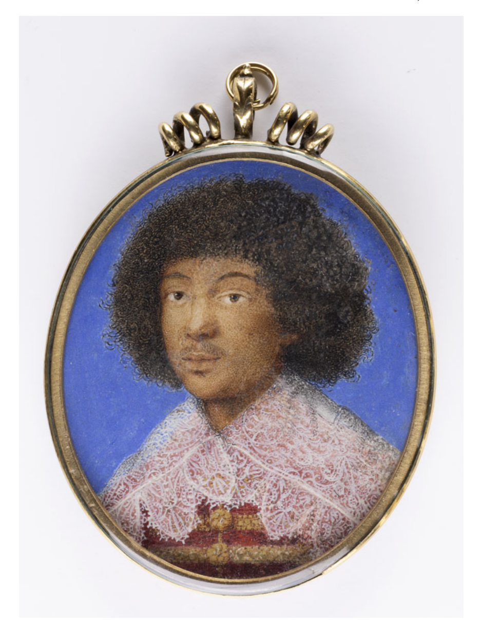
Figure 1. Portrait of Zaga Christ by Giovanna Garzoni, 1635.