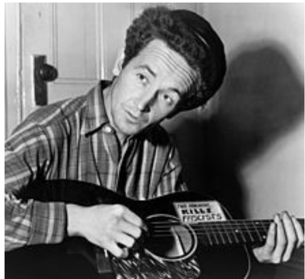
Woody with guitar labeled “this machine kills fascists”, 1943.

Throughout the 1930s, Woody opposed American involvement in World War II, writing and performing numerous antiwar songs that excoriated Franklin Roosevelt as a duplicitous warmonger. His view shifted after 1941 when Hitler broke the 1939 Molotov-Ribbentrop non-aggression pact and replicated Napoleon’s folly by attacking Russia which then joined forces with the Western allies to fight fascism. 2 With the U.S. in the war after Pearl Harbor, Woody began penning songs like “Lindbergh,” which excoriated the isolationists and America First, though another of his songs expressed a secret desire for all the soldiers “on every single side” to “take off [their] helmet, unbuckle [their] kit, lay down [their] rifle ...and say, nope, I ain’t gonna kill nobody.” 3