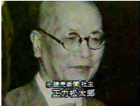
Shoriki Matsutaro (1885 - 1969)

Shoriki began working with the CIA after the war and supported Japan's possession of nuclear weapons as a member of the US Cold War alliance against the Soviet Union. To this end he promoted the "peaceful use of atomic energy," utilizing his media companies to build support in Japan. Shoriki and others in the pro-military camp calculated that research in nuclear energy would lead, in the future, to Japan's development and possession of nuclear weapons. 1