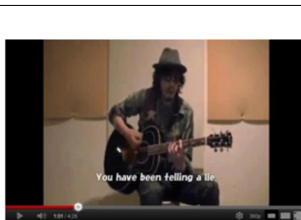
Saito Kazuyoshi's song, with English subtitles ( LINK to view video)