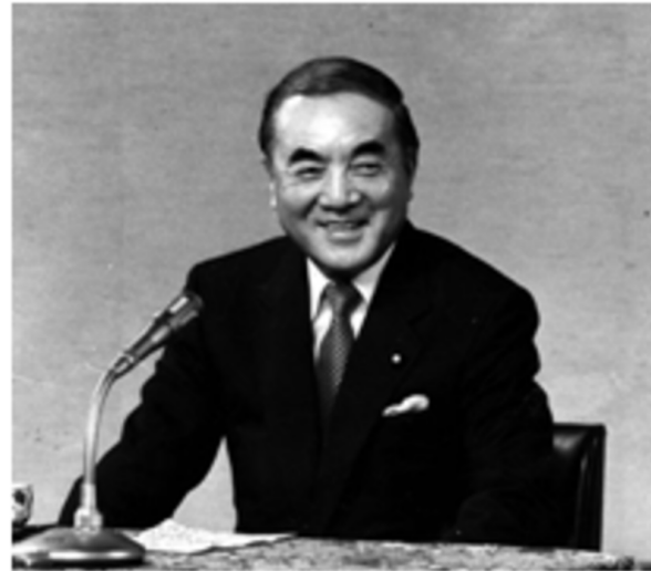
Nakasone Yasuhiro (1918 - )

Another figure was Nakasone Yasuhiro, the former prime minister who carried out the privatization of Japan's national railways. Nakasone had shown interest in nuclear power when he was in the Japanese Navy during the war, and as soon as he became a politician after the war, he delivered a petition on nuclear energy research to the Supreme Commander of the Allied Powers, Gen. Douglas MacArthur. When Nakasone submitted a budget for nuclear energy development to the Diet in 1954, nuclear energy was launched in Japan.