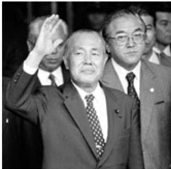
Tanaka Kakuei (1918-1993)

Following in Shoriki and Nakasone's footsteps as the standard bearer for nuclear power was former prime minister Tanaka Kakuei, famed for his Plan for Remodeling the Japanese Archipelago.