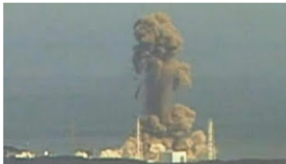
Explosion at No.3 Reactor of Fukushima Daiichi, March 14, 2011

At midnight on April 22, 2011, the Japanese government designated the zone within a 20-kilometer radius of the Fukushima nuclear power plant a controlled area under the Basic Law for Disaster Countermeasures. As a result, all entry into the zone was prohibited without special government permission. Some 78,000 people were separated from their homes, without knowing when they might return.