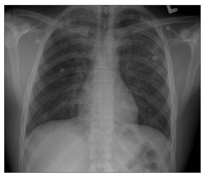
Fig. 3. Repeat chest radiographs taken 8 hours after injury showing mild, interval improvement in the upper lobe airspace disease and increased involvement of the mid and lower lung zones.

Widespread implementation of automobile airbags in MVCs has resulted in a substantial reduction in mortality.<sup>1</sup> However, this increased use has also been associated with new patterns of injury caused by airbag deployment. These injuries, while minor compared with those associated with non-use, include fractures, chemical burns, blunt cardiovascular trauma, ophthalmologic injury and soft tissue injuries.4-6 A review of the literature (Medline 1966 to 2006 using the MESH terms airbag injuries, sodium azide, airbag and pneumonitis) identified few cases of inhalation injuries related to the release of toxic compounds during airbag deployment.7-12 One case of subglottic injury was reported following airbag rupture causing a clinical presentation of bronchospasm in a patient with underlying lung disease.8 Gross and colleagues reported that 40% of asthmatics experienced significant bronchoconstriction after airbag deployment.7 Further studies suggested the primary irritant was the particulate matter and not the gaseous com-