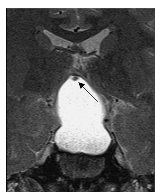
Figure 2: Magnified T2-weighted coronal image with the hypointense nodule highlighted (arrow) characteristic of Rathke's cleft cyst, confirming the pre-operative imaging diagnosis.

and are T2 hyperintense compared to the hypointense Rathke's cleft intracystic nodule. 1,4,5 This case highlights an important imaging feature that may help to differentiate between two