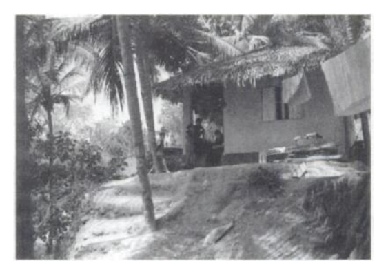
Top: Latha Hackett conducting a psychiatric assessment interview in the home of one of our subjects; middle: with no possibility of privacy, interviewing had to cope with the extended family and neighbours; bottom: psychiatric assessment at a child's home.