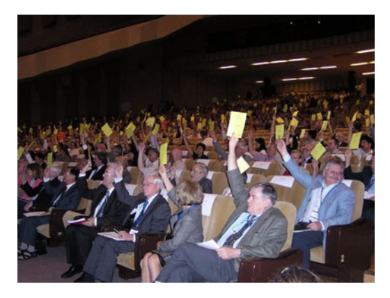
Figure 1. The vote on resolution 5A, IAU GA Prague.

margin, so a Dwarf planet is not a planet and at 15:34 CEST 24 Aug 2006 Pluto ceased to be a planet as defined by IAU resolutions.