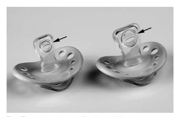
Fig. 2. The novel slow-release pacifier with pouch ( † ).

The probiotic bacterium used was BB-12 (DSM 15954; Chr. Hansen A/S, Hoersholm, Denmark). BB-12 is a safe and well-tolerated probiotic<sup>(13)</sup>. The parents were advised to give their children two probiotic tablets per day via a novel slow-release pacifier (Alanen and Söderling, US patent 6.203.566, 2000). The pacifiers (Fig. 2) were manufactured by Mekalasi Oy (Konnevesi, Finland). The pacifier contains a pouch in which the tablet is inserted. Each tablet contained 5 billion colony-forming units of BB-12. Until 6-8 months of age, the children received the tablet via a small pacifier, thereafter via a larger pacifier. The tablet in the small pacifier contained 100 mg xylitol (Danisco Limited, Kotka, Finland), the tablet in the larger pacifier contained 300 mg xylitol, both in addition to BB-12. The control tablets contained xylitol alone. All the tablets were manufactured by Oy Karl Fazer Ab (Vantaa, Finland)