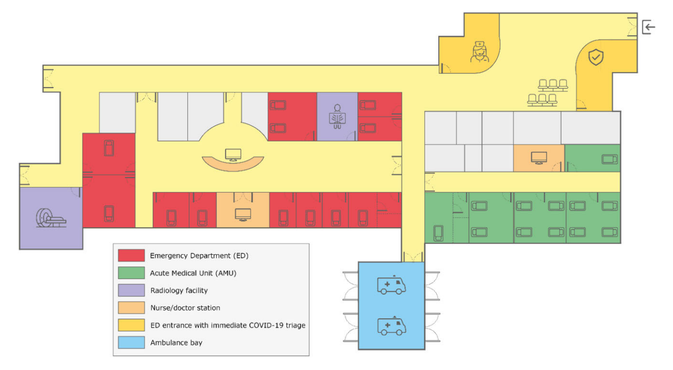
Figure 1. Descriptive floor plan of our AMU (Green area) directly adjacent to our ED (Red area), during the pandemic phase designated into high-risk (Red) and low-risk (Green area). AMU and ED are directly accessible for walk-in patients and ambulance patients. Radiology facilities are located in the ED.

During the aftermath of a collapsed ED ceiling in 2017, the AMU was rapidly set up as a temporary ED.7