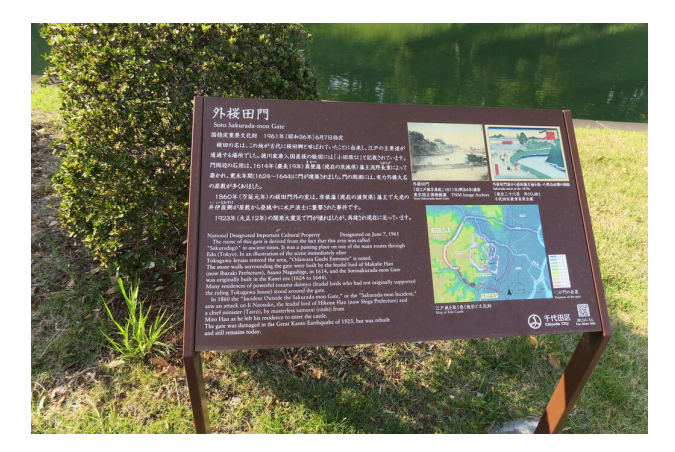
Figure 2: Bilingual signboard at Sakuradamon gate.

On March 24, 1860 Tairo (great elder) Ii Naosuke, the most powerful official in the Tokugawa bakufu, was approaching the Sakuradamon gate of Edo castle when his retinue was attacked by a troupe of 17 shishi ("men of high purpose") from the Mito domain (and one from Satsuma). A heavy snow was falling, and the oilskin protective clothing worn by Ii's guards made it difficult for them to draw their swords quickly. During the bloody melee, Ii, age 44, was dragged out of his palanquin and decapitated.