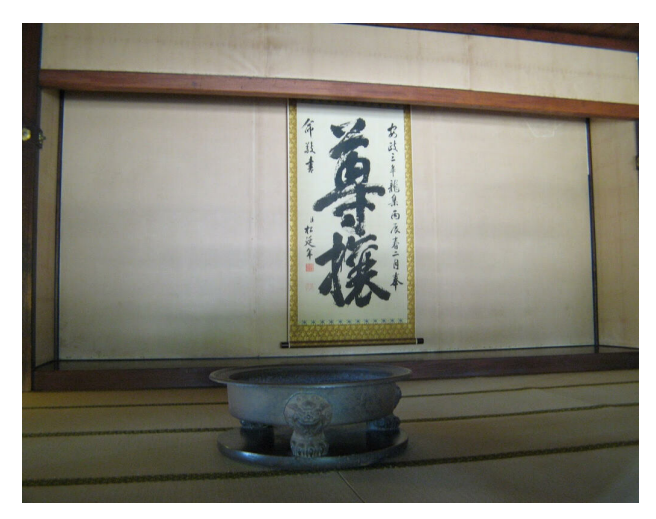
Figure 8: "Sonjo" scroll hanging at the Kodokan academy in Mito, where young samurai were imbued with the slogan "Sonno Joi" (revere the Emperor and expel the barbarians). Photo by the author.

Figure 7: Grave of Townsend Harris's interpreter Henry Heusken at Korinji temple in Azabu. Photo by the author.