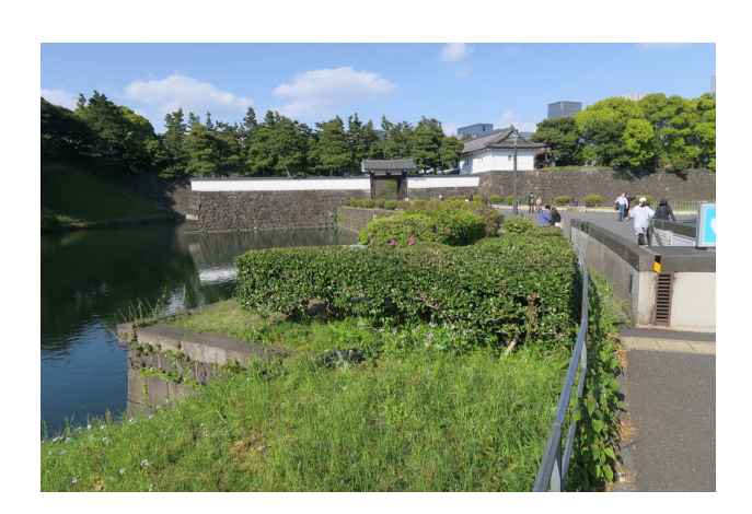
Figure 3: The Sakuradamon gate as it appears today.

Two years earlier, Ii had ordered the Ansei Purge, jailing, exiling and in some cases executing 100 individuals suspected of disloyalty to the Tokugawa government. The killers also objected to Ii's having negotiated, and in July 1858 signed, the Treaty of Amity and Commerce between Japan and the United States, as well as subsequent treaties with European powers.