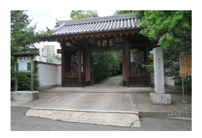
Figure 6: Gate of the Tozenzi temple, site of Great Britain's first legation in Edo where Kobayashi Denkichi was assassinated.

On January 29, 1860, Kobayashi Denkichi, interpreter to the British legation, was fatally wounded by two samurai outside the gate of the Tozenji temple in Takanawa, just off the Tokaido road linking Edo to Kyoto. The Wakayama native's fishing boat had gone adrift when he was rescued by an American vessel and taken to San Francisco, where he learned English. He later traveled to Hong Kong, acquired British nationality and accompanied Great Britain's first ambassador, Sir John Rutherford Alcock, to Japan in 1858.