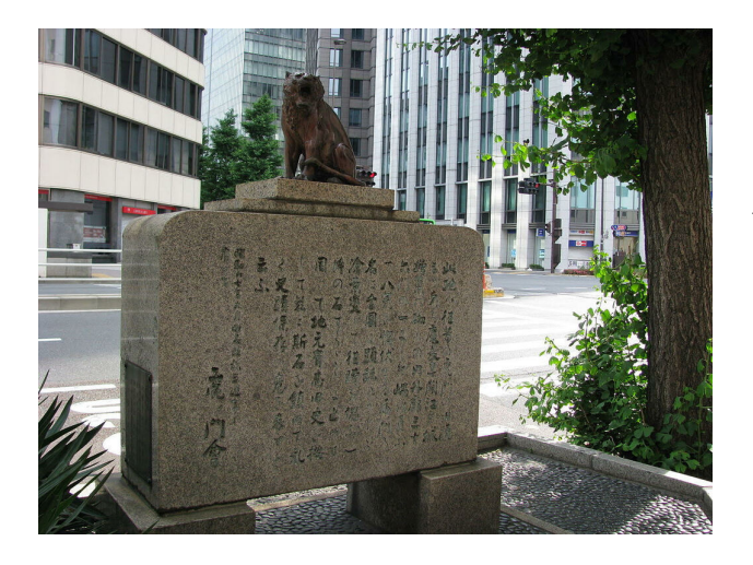
Figure 14: Memorial near Toramon subway station where Crown Prince and Regent Hirohito was targeted by an assassin in December 1923.

the Toranomon intersection while en route to a Diet session. Hirohito was unharmed.