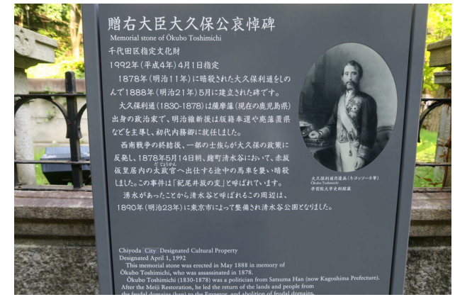
Figure 10. Signboard at Shimizudani Park, site of Okubo's assassination.

On Feb. 11, 1889, a national holiday and the same day on which the Meiji Constitution was promulgated, 43-year-old Minister of Education Mori Arinori was stabbed while exiting the Prime Minister's Office by an assassin wielding a kitchen knife. He died the following morning. The University College of London-educated Mori, who had formerly served as Japan's first ambassador to the United States, was a controversial figure who advocated some