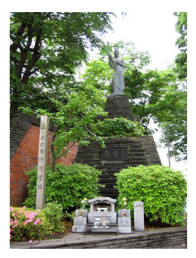
Figure 19: Statue of the goddess Kannon erected on the spot in Shibuya where the Feb. 26 assassins and their leaders were executed.