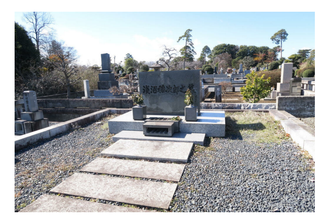
Figure 22: Asanuma's grave in Tama Cemetery, west Tokyo.

Fifty years to the day of Asanuma's assassination—on October 12, 2010—the Otoya Yamaguchi Appreciation Society held a ceremony to commemorate Yamaguchi's "heroic" act.