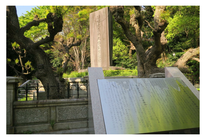
Figure 9: Monument at the site of Okubo Toshimichi's assassination in May 1878.

Japan's restoration to imperial rule from January 3, 1868 would eventually leave a large class of disenfranchised samurai, resentful over the loss of their power and class privileges. On May 14, 1878, the carriage of Lord of Home Affairs Okubo Toshimichi was attacked by a group of ex-samurai from the Kaga domain (Ishikawa Prefecture). The 47-year-old Okubo, a native of Satsuma (Kagoshima) and remembered as one of the three great nobles who led the Meiji Restoration, was literally cut to ribbons and died on the spot. The monument to Okubo and an explanatory bilingual signboard are situated in Shimizudani Park in Kiyoi-cho, directly across the street from the Hotel New Otani.