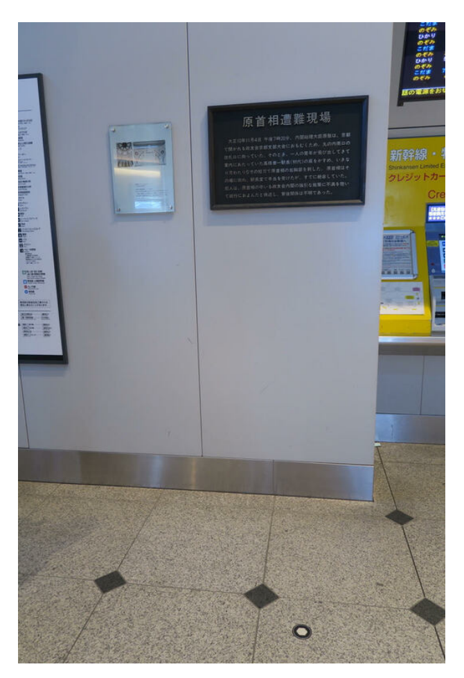
Figure 16: Small white hexagon on the floor of Tokyo Station (Marunouchi South Exit) indicates where PM Takashi Hara was standing at the moment he was slain. Explanation is posted on the wall behind it.