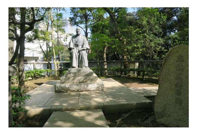
Figure 18: Statue of Takahashi Korekiyo at the site of his former residence in Aoyama.

The four important figures assassinated that day included 81-year-old Minister of Finance Takahashi Korekiyo who had previously served as president of the Bank of Japan and prime minister. At gunpoint, a servant led two officers into his bedroom, where they killed Takahashi as he slept.