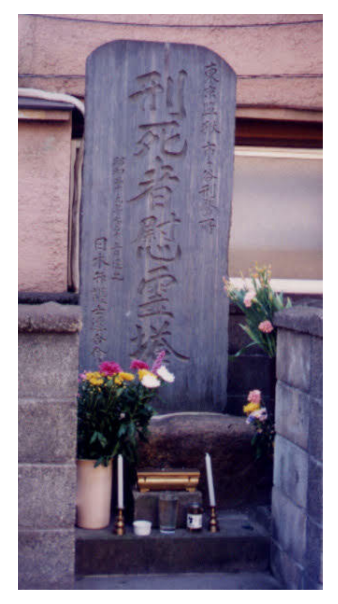
Figure 11: Monument erected by the Japan Bar Association at the site of the gallows at the former Ichigaya Prison, where Kotoku Denjiro and 11 other anarchists were hanged for plotting to assassinate the Meiji Emperor.