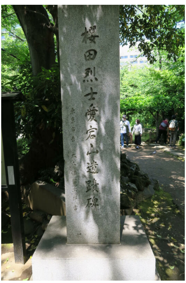
Figure 4: Monument to Ii's assassins, who converged at the Atago Shrine before embarking on their bloody quest.

Romulus Hillsborough's 2017 work, Samurai Assassins: "Dark Murder" and the Meiji Restoration, 1853-1868 explains the background, circumstances and description of the Sakuradamon Incident. The book also details the unsuccessful attempt on the life of Ando Nobumasa, Ii's successor, in a similar attack outside the Sakashita gate of the castle on February 13, 1862.