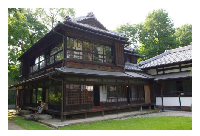
Figure 20: Takahashi Korekiyo's former house was moved to an outdoor museum in Koganei. He was killed while sleeping in an upstairs bedroom.

Takahashi's former residence became a memorial park next to the Canadian Embassy in Aoyama. The house in which he was slain still stands, and can be visited at the Edo-Tokyo Open Air Architectural Museum in Koganei City.