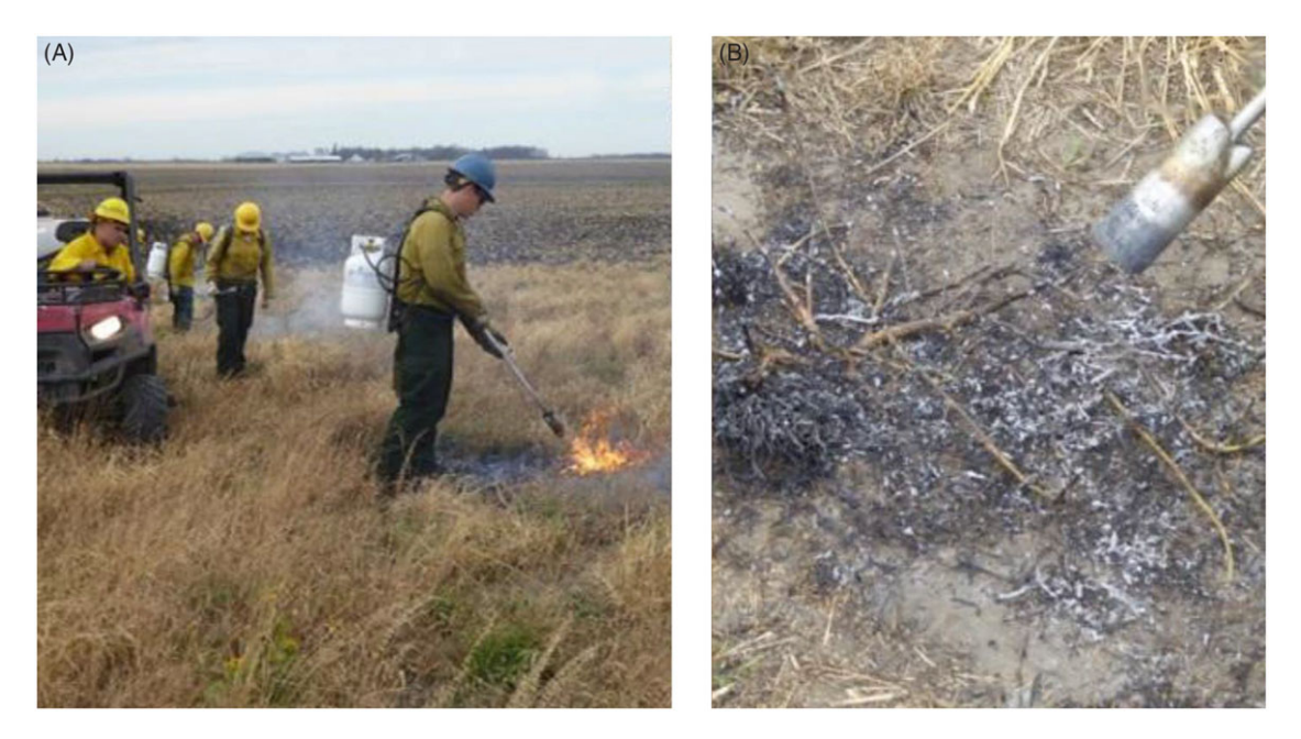
Figure 3. (A) CCMI crew members burning a Palmer plant in Lyon County using propane torches. (B) Scorched ground after Palmer incineration using propane torches.

and to provide extra protection against any seed that germinated after the fall of 2016 and spring of 2017 burning events.