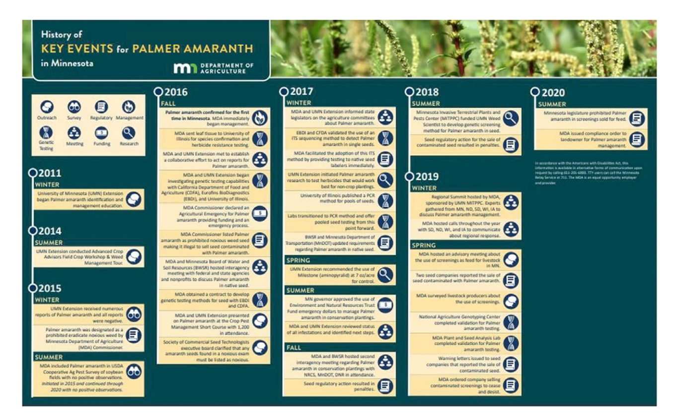
Figure 1. History of key events for Palmer amaranth in Minnesota.

damaging glyphosate-resistant weeds in the United States (Beckie 2011). Protoporphyrinogen oxidase (PPO) inhibitors became a popular option for controlling glyphosate-resistant Palmer amaranth biotypes (Owen and Zelaya 2005). Similar to the development of glyphosate resistance, repeated use of PPO-inhibiting herbicides on Palmer amaranth has resulted in the evolution of resistance, which was first reported in Arkansas (Salas et al. 2016).