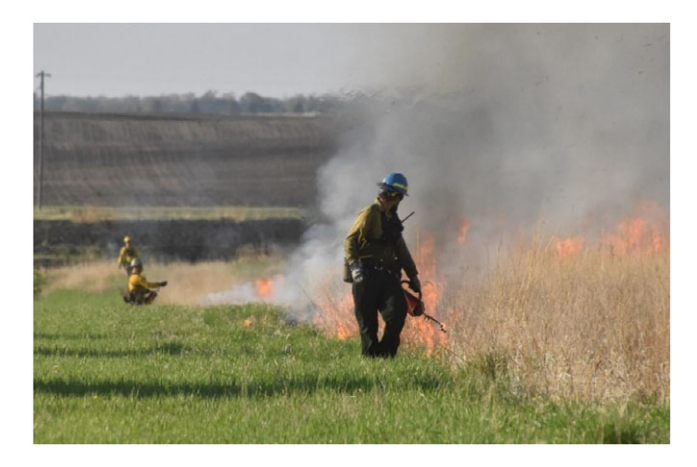
Figure 5. Crews burn CRP pollinator plantings sowed in 2016 with Palmer amaranth contaminated seeds in Lyon County, MN. All sites surveyed and monitored in Yellow Medicine County and Lyon County which was a result from the first Palmer amaranth find in Minnesota.

inspection found two seed lots of buffalograss [ Bouteloua dactyloides (Nutt.) J.T. Columbus] that were contaminated. The vendor cooperated and returned these lots to the state of origin, Nebraska, and provided a single site in Nicollet County where that seed had been planted as part of a native seed mix. Continued mowing at that site has prevented the establishment of Palmer amaranth. A native seed mix planted on an MnDOT right-of-way also tested positive for Palmer amaranth in Cottonwood County. MDA aggressively monitored all these sites in 2018, 2019, and 2020 and has not found any Palmer amaranth plants at any site.