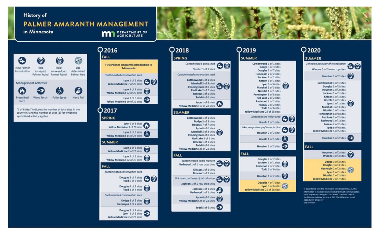
Figure 2. History of Palmer amaranth management in Minnesota.