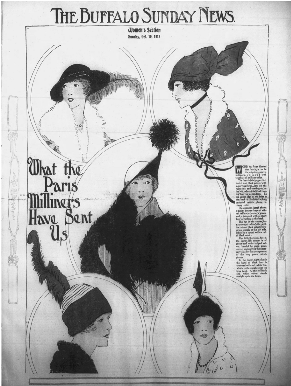
Figure 5. Full page from Buffalo Sunday Morning News , Oct. 19, 1913, first page of women's section.

of packed auditoriums for its free "Cookery and Homemaking Schools," with audiences ranging from 3,000 to 10,000. 91