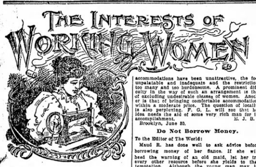
Figure 3. The illustrated headings for “The Interests of Working Women” pictured some of the most common working-class women’s occupations: stenographer, shoppgirl, and seamstress. New York World , July 5, 1896, 29; June 28, 1896, 31; July 12, 1896, 29.

assured the teacher that she was not alone. 55 The columns could help women readers to recognize common problems and even hash out solutions. One letter to the Ledger complaining of a high February gas bill brought an avalanche of similar stories over the next few weeks. Eventually the column’s editor weighed in, calling for oversight and documentation of a system that left the housekeeper no way of knowing if she was being overcharged. 56