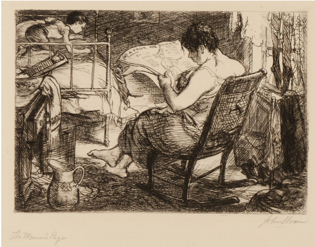
Figure 7. John Sloan (American painter, etcher, and illustrator, 1871–1951), The Women's Page , 1905. Etching. Plate: 4 13/16 × 6 3/4 in. Sheet: 9 1/4 × 12 5/8 in. Gift of Helen Farr Sloan, 1963.

offered genuine service and counsel, and could feed very real needs. 119 Yet by transitioning away from open letter columns and toward themed advice columns, newspapers eliminated the space in which women readers advised each other. They stopped reminding subscribers of the knowledge, generosity, and goodwill of the other women who were also reading and writing to the newspaper and instead trained them to look to experts for advice.