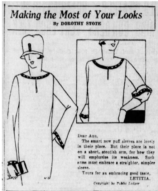
Figure 8. Dorothy Stote’s “Making the Most of Your Looks” always pictured slim white women and spoke about their figures as needing to be fixed. Here the article refers to “a short, stoutish arm.” Mansfield News (Ohio), Feb. 8, 1927, 11; the feature was syndicated by the Philadelphia Public Ledger .

responses with silverware. The Call sometimes aired readers’ pointed or even radical critiques of the status quo, from a woman who recounted going on strike from housework to one who advocated adopting men’s dress. Yet the Call belittled these responses when it printed above them “Awarded a silver cheese scoop,” or “Awarded a silver jelly spoon,” and it seemed to send the winners right back to domestic duties with their prizes. 121 In a 1927 article titled “What Shall We Do With the Woman’s Page?” Crystal Eastman called for a more open, collaborative space in the newspaper. “Modern women need a forum, a clearing-house for the exchange of ideas, a meeting-place where they can learn of each other’s experiments and benefit by each others conclusions,” she wrote. 122 Eastman had no memory of the turn-of-the-century women’s columns that had sometimes served these purposes.