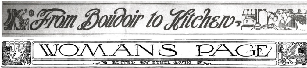
Figure 6. Illustrated headings for the women's page, seemingly indicating women's domain. Referring to and picturing women only within the home might have communicated luxury or constraint, depending on the reader. Buffalo Sunday Morning News , Mar. 23, 1913, 28; Chicago Defender , Apr. 23, 1921, 5.

Some readers asked for and appreciated the optimism, fantasy, and escape of the women's page. Answering the New York Herald's 1891 survey of what women wanted in their newspapers, one reader responded "write us long columns of happiness." 112 A 1901 reader praised the Atlanta Constitution's women's page for casting "sunbeams across the home keeper's dusty, every day road." 113 In a 1904 etching, the artist John Sloan depicted the escapist pleasure to be had from the women's page (Figure 7). A woman in a tenement momentarily ignores or forgets her surroundings—the unfinished washing in the basin, the cat that is clawing the comforter. Instead she peruses the newspaper's "Page for Women."