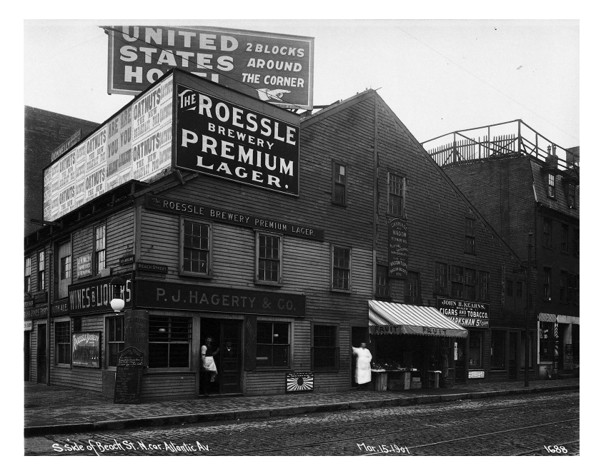
Figure 1 P. J. Hagerty's Boston saloon on the south side of Beach Street, near the corner of Atlantic Avenue.