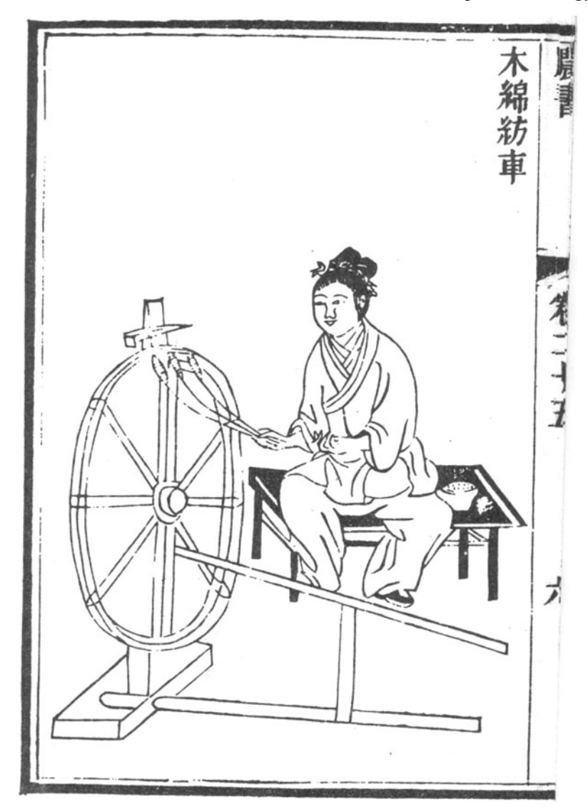
Figure 3. Spinning wheel for cotton. Wang Zhen's Nongshu (Agricultural Treatise), 1783 Palace edition, Chapter 25, 6a.

In the case of the cotton-processing implements, the gin, bow, spinning wheel and multi-bobbin reels which Wang Zhen describes for the first time in his 'Illustrated register' (Figure 3), his accounts seem to have passed muster even with the exigent Xu, who adds only a few notes explaining minor changes in structure or operation. 63 Here Wang's hope for diffusion was realized: these implements were gradually adopted