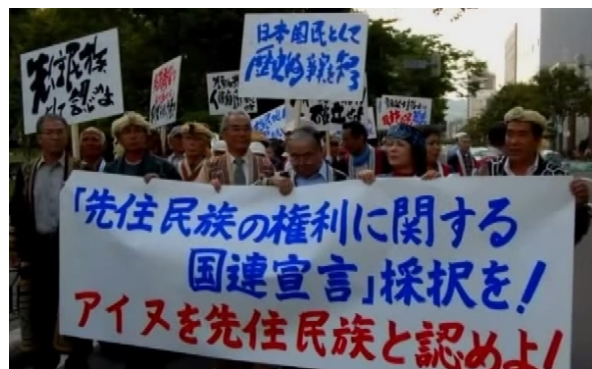
Demonstrators call for official recognition of the Ainu's rights as indigenous peoples.

But in these cases, Ainu policy as construed in terms of the constitution depends not upon clear stipulations found in the actual constitution itself, but rather on the interpretations of a handful of constitutional scholars. Moreover, Article 13 of the constitution clearly deals with the human rights of individuals (not of groups), and does so only to the extent that this "does not interfere with the public welfare". In other words, while the criteria of the United Nations Declaration on the Rights of Indigenous Peoples emphasizes the centrality of collective rights, Ainu policy falls at the exact opposite end of the spectrum: it is presented as a matter of the rights of individuals to "life, liberty, and the pursuit of happiness". Tsunemoto came to refer to this unique rights policy in 2010 as "Japanese-style Indigenous Peoples' Policy" 25 . Not surprisingly, this idea has become an extremely effective back-up for the Japanese government, particularly for central government bureaucrats who are reluctant to support group rights.