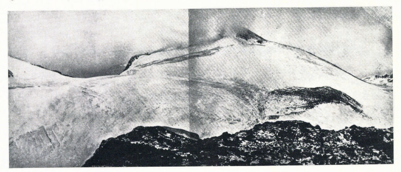
Fig.1. Photograph of Grasshopper Glacier, taken in 1898 by A.B. Wilse.

Ferrigno: Recession of Grasshopper Glacier