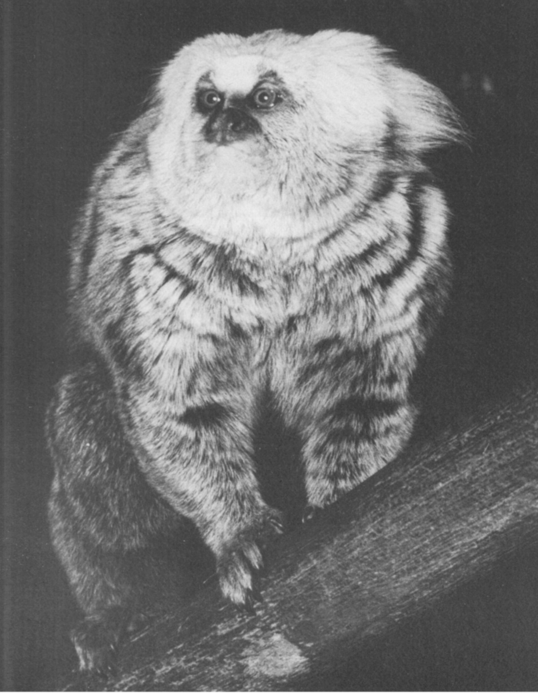
Buff-headed marmoset 381