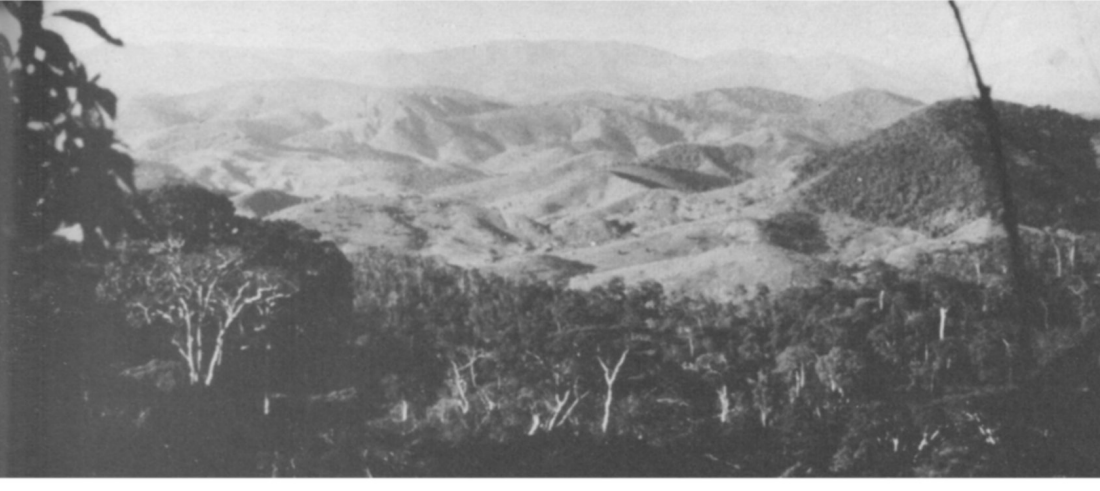
Part of the Monte Claros forest. The barren hills behind were once covered with forest. Russell A. Mittermeier

eastern Brazilian monkeys – the others are the three lion tamarins Leontopithecus. Several endangered birds also live in Montes Claros, among them the solitary tinamou Tinamus solitarius and the blue-throated conure Pyrrhura cruentata.