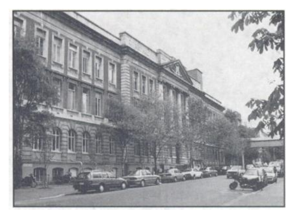
Fig. 3. Dunedin School of Medicine, New Zealand

it was not surprising that they felt unable to continue.