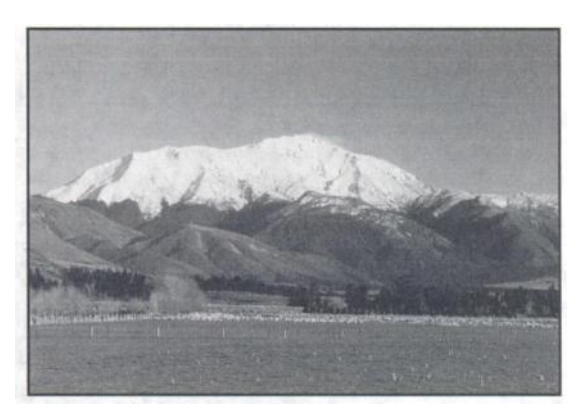
Fig. 2. Mount Hamilton, Southland, New Zealand