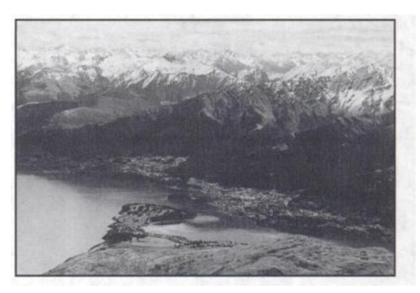
Fig. 1. Southern Alps, New Zealand

Southland is the southernmost (latitude 46° south) province of New Zealand. It covers an area of 34347 km<sup>2</sup> consisting of pastoral lands. beautiful beaches, snow-covered mountains in the Southern Alps (see Figs 1 & 2) and flords and rainforests in Fiordland. The population is a little over 100000, mostly of Scottish and Irish extraction. These families arrived in this remote corner of the Antipodes 150 years ago. Indigenous Maoris, who were the first to settle these areas constitute about 11% of the population. Roughly half of the population is concentrated in Invercargill, which is the main urban centre. Sheep and dairy farming are the main industries, however, Invercargill boasts of having the lone aluminium smelter in the country which utilises the power generated from the country's largest hydroelectric plant at Manapouri lake. Two hundred kilometres to the north is the city of Dunedin, a university town (population 115 000) that is the centre of the province of Otago. The Otago Medical School, New Zealand's oldest medical school is established here (see Fig. 3), with Dunedin being the centre of regional and tertiary medical services. The regional forensic psychiatric centre is in Dunedin, as was the large psychiatric hospital, Cherry Farm Hospital, until its closure in 1992 when the community psychiatry movement landed, rather belatedly, on these shores.