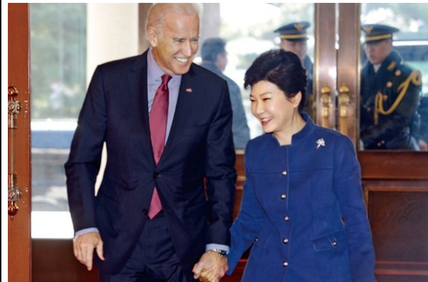
US Vice President Joe Biden clasps hands with President Park Geun-hye at the Blue House before Biden signs the visitor's book, Dec. 6. 40

So, in analysing world affairs the starting point must be the US. What does America want? That, needless to say, often bears little connection with what it proclaims as its objective. Analysis must be hard-nosed looking beyond the spin and rhetoric, focussing on actions and seeking real explanations. When we have some idea of America's position we can start looking at the other players, in descending order of importance. For most countries, most of the time, the United States is their major strategic partner-cum-adversary. They tend to tailor their policy in relation to third countries in the light of their political relationship with the United States. However for many countries, and South Korea is by no means alone, there is the dilemma of reconciling the economic importance of China with the relationship with the US. 39 At the same time we must presume that Washington has a global grand strategy (however incoherent and subject to various factions that may be) and that this strategy prioritises and subordinates the part to the whole.