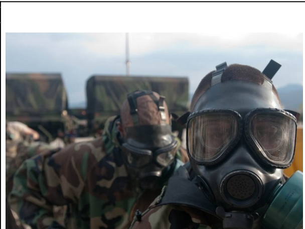
The 20th CBRNE Command (Chemical, Biological, Radiological, Nuclear, Explosives) is participating in Exercise Ulchi Freedom Guardian in South Korea, Aug. 17 - 28. 53

When the United States looks at Korea, it sees China.