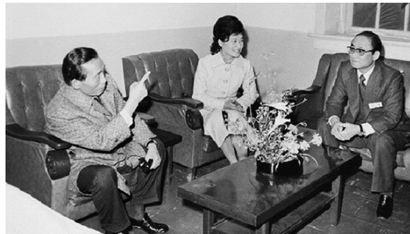
President Park Geun-hye, center, who served as first lady for her father President Park Chung-hee, left, after her mother was assassinated, speaks to Choi Tae-min, her mentor and the father of Choi Soon-sil, at a hospital owned by Guguk (save-the-nation) missionary group, set up by the senior Choi, in 1976.

Early revelations, with presumably more to come, on the role played by Choi Sun-sil (also transliterated Choi Soon-sil), Park Geun-hye's 'Shaman confidante' in influencing policy towards North Korea are shedding new light on this strange, rather dysfunctional administration. 106 Choi Sun-sil inherited her relationship with the Park family, father and daughter, from her father Choi Tae-min, who was labelled in State Department cable, Korea's Rasputin. 107