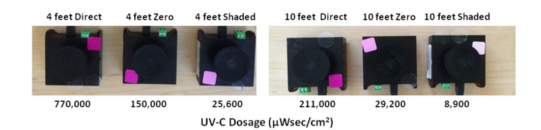
FIGURE 2. Results obtained with qualitative photochromic dosage indicator labels (red, pink, and white rectangles attached to sensors) and dosages ( \mu Wsec/cm<sup>2</sup>) measured using radiometric ultraviolet C (UV-C) light sensors placed at various distances from and orientations relative to the UV device after a 15-minute cycle. UV-C light normally enters the radiometric sensors through openings that were covered by circular elevated caps at the time photographs were taken.