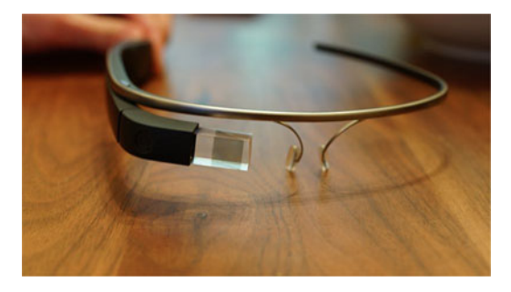
Figure 2. Google Glass.

object in space, integrating context and environmental information, a capability that is useful for multiple user collaboration and experience.