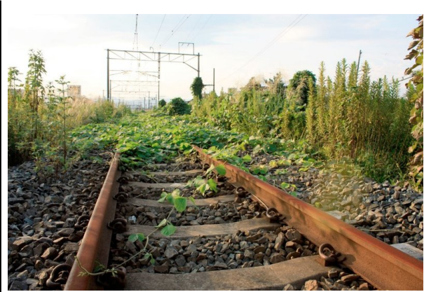
Namie became a ghost town

The crisis in Fukushima is even more serious in many respects. In Fukushima, the level of devastation is extremely high, and as at August 2012, approximately 111,000 people have been forced to evacuate by the government with no or limited prospects of returning to their homes. 35 The impact of the nuclear crisis is global rather than regional, and in respect of the ecosystem, it is not yet possible to determine its ultimate impact. The underlying power structure of the Japanese 'nuclear village' is more formidable than that of Chisso. Its power is reinforced by close links to the international nuclear regime. The causal link between exposure to the poison and illness is much harder to establish in the case of irradiation: low level irradiation does not result in distinctive symptoms as in Minamata disease; it takes many years to manifest as cancer, the cause of which is difficult to single out; and impact upon the unborn, infants and young children is unknown.