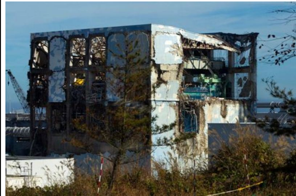
Fukushima Daiichi Reactor No.4, May 2012.

Experts fear that a catastrophe on an even larger scale could still occur. Koide Hiroaki, a nuclear scientist at Kyoto University, warns that Japan 'will be finished' if approximately 300 tons of spent nuclear fuel (4,000 times the size of the Hiroshima atomic bomb) kept at the spent-fuel pool in the badly damaged No. 4 reactor building, release radiation as a result of a cooling failure caused by, for instance, another earthquake. 11 If this happens, the entire Fukushima nuclear complex will become inaccessible, leading to radioactive emissions on a cataclysmic scale, perhaps 85 times as great as Chernobyl. 12 TEPCO reported previously that as of March 2010 there were 1,760 and 1,060 tons of uranium at Fukushima Daiichi and Daini, respectively. 13 A simple calculation, based on Koide's estimate above, suggests that this is equivalent to 28,000 Hiroshima bombs. A 'chain reaction' involving all six reactors and seven spent fuel pools at the complex was envisioned as the 'worst case scenario' by Kondo Shunsuke, Chairman of the Japan Atomic Energy Commission, in his report submitted to the government two weeks after March 11. The report, which was suppressed by the government, concludes that if the 'chain reaction' happens, the exclusion zone may have to be greater than 170km. 14 Tokyo is 220km away from the plant. Kondo's report thus is largely consistent with Koide's prediction, although they hold opposite positions on the question of nuclear power generation.