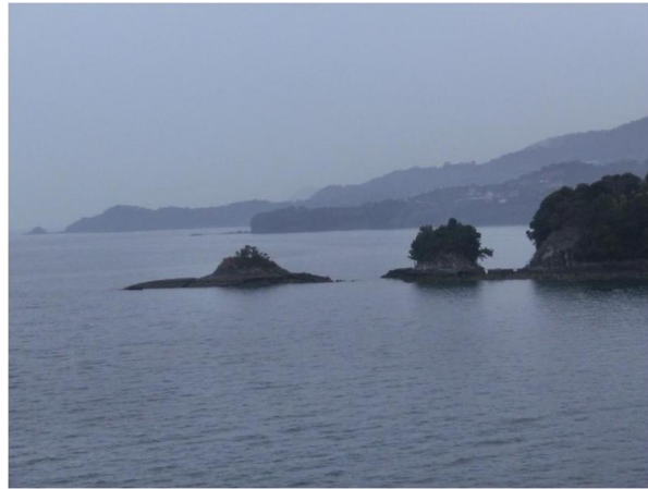
Minamata Bay in winter.