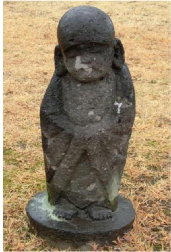
A Stone Buddha on the reclaimed land in Minamata.

In the past, we were permitted to live in this world and we had a variety of practices that helped us to feel the connection. Each one of us was connected as a living life with various other lives. We lived it out.... When I was involved with the Minamata movement, I thought, deep in my heart, that I was living on my own. But when that sense crumbled, I realised that I live, and am allowed to live by being connected to various other living things. 80