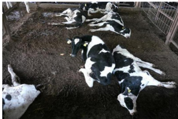
Starving cows in Fukushima

When I considered Chisso as offender, I thought that I had nothing to do with it. I thought that it was just a company, with power in the system. But when I began to perceive myself as 'another Chisso', I experienced a sense of crisis that I myself was moving away from the connectedness of life. 63