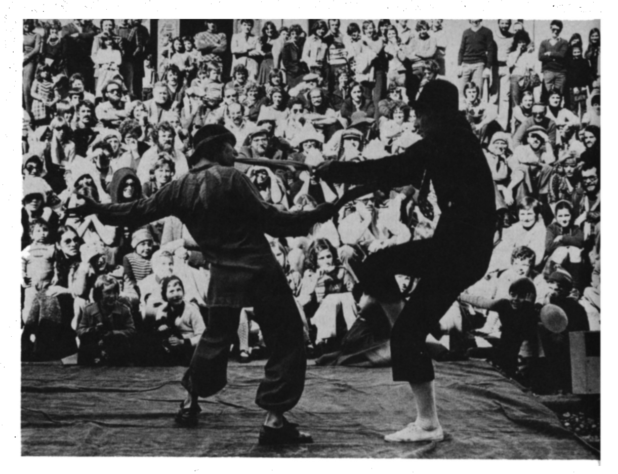
Moment in clown show in Carpignano.