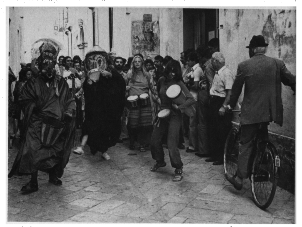
Odin ensemble members "parade" in Carpignano.