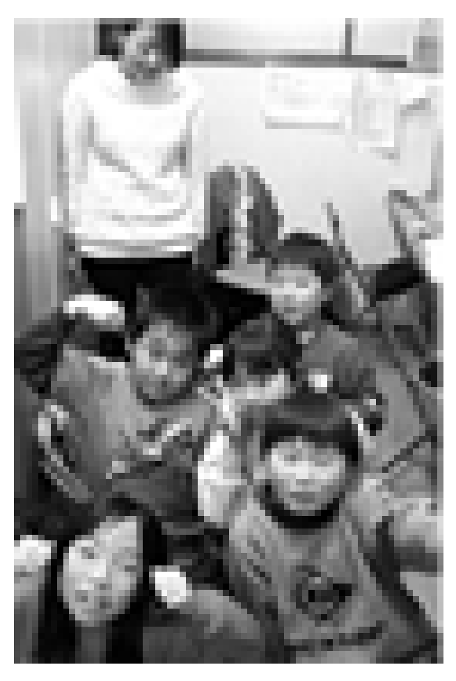
JWCU Hompage, May 2006

projects on the other, the union took the unusual step of transforming itself into a business owned and democratically run by its members, that would contract for work with a variety of organizations.