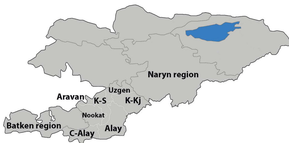
Figure 1. Map of the regions (oblast') and districts (raion) of the Osh region of Kyrgyzstan covered in the study. C-Alay, Chon-Alay; K-Kj, Kara-Kulja; K-S, Kara-Suu. Modified from the original image available at Wikimedia Commons, Created by Rarelibra 3 August 2007.

There was no difference in CE prevalence relative to gender (odds ratio [OR] = 1.13 for men). The age distribution of CE prevalence was relatively even (Table 1), with somewhat higher prevalence at an age over 60 (OR = 1.33, P < 0.05 vs other age groups combined). This profile was compatible with the recent emergence of the epidemic, because elderly subjects did not accumulate exposure over their whole lives proportional to their age. Expectedly, the fraction of post-resection cases was somewhat lower among younger patients, 57% of the total prevalence in