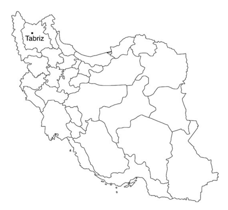
Figure 1 Location of Tabriz in the map of Iran.