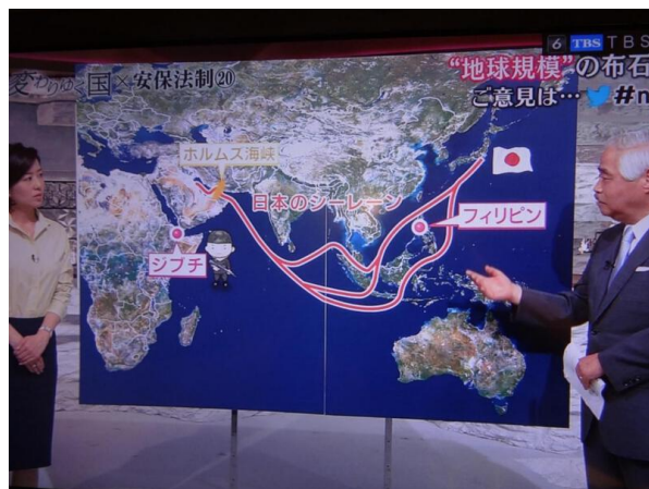
Fig. 4: The portrayal of SLOC as vital for Japan's national security in debates about legislative and constitutional change for allowing overseas military deployments. (Screenshot by the author, Tokyo, 2013)

On the one hand, China's economic catching up shifted and challenged the cognitive boundaries that had long differentiated the developed 'West' from the developing 'East'. Established actors' resistance to this reordering of the mental map accentuated bordering practices that aimed at reinscribing the 'East'-'West' division. This, in turn, strengthened the Chinese leadership's resolve to accelerate the 'rejuvenation' of the country, such as through the proclamation of the Belt and Road Initiative (BRI) in 2013. It also triggered the decision to embark on massive land reclamation in the Spratlys with the aim of creating a military buffer zone in the South China Sea. On the other hand, the US and especially its Australian and Japanese allies, worried about Chinese moves and, anxious about declining US power, reached out to new partners. To India in particular. Various initiatives for militarily securing 'freedom' and 'openness' across the 'Indo-Pacific' emerged. Following, countering, and mirroring the BRI,