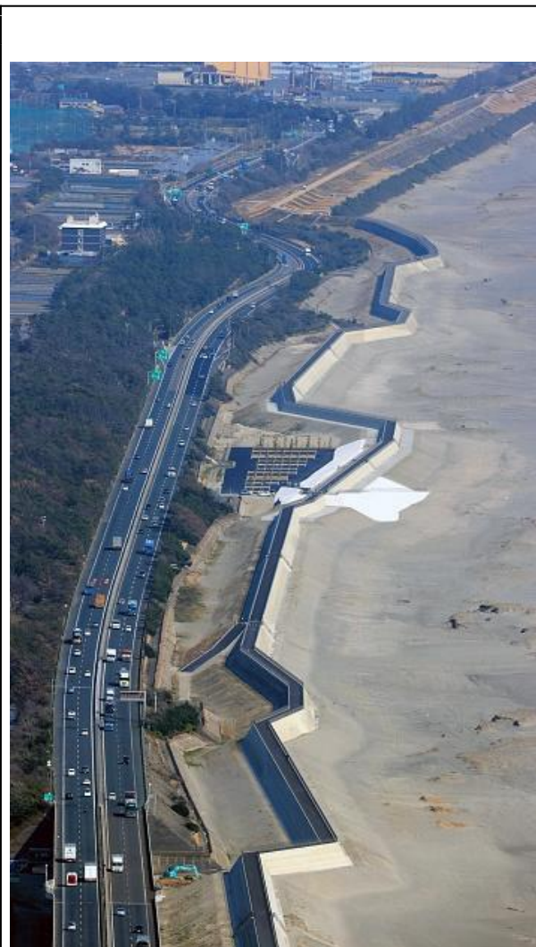
Fig. 1: Breakwater along the coastline in Hamamatsu, Shizuoka Prefecture, Japan

ecological sustainability that are crucial for future prosperity.