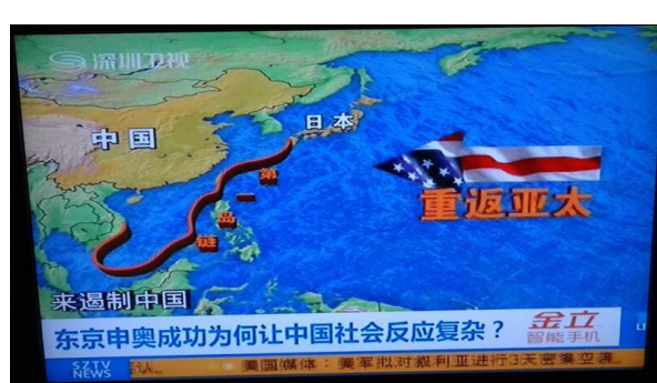
Fig. 3: Chinese perception of the US Pivot to the Asia-Pacific and 'First Island Chain' as its primary defense perimeter

The danger produced from this antagonistic interaction reinscribed the boundary between 'East' and 'West' along the former perimeter of defence against the Communist Threat, originally drawn by former U.S. Secretary of State Dean Acheson in January 1950. 12 Hence, the Korean Peninsula, the East China Sea, Taiwan - and the South China Sea - continue to be contested frontiers in the ostensible civilizational struggle. This bordering effect became visible in the way the Obama administration implemented its pivot to the Asia-Pacific, and in how it was perceived by the leadership in Beijing (Fig. 3).