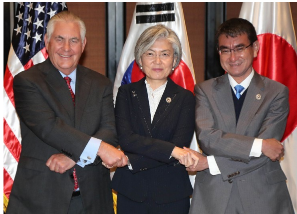
Foreign Minister Kang Kyung-wha, center, holds hands together with U.S. Secretary of State Rex Tillerson, left, and Japanese Foreign Minister Taro Kono during their joint talks on the sidelines of the ASEAN Regional Forum in Manila, the Philippines, Monday.

Strange sentiment, one might argue, for a government propelled into power by opposition to Park Geun-hye, who in deference to the US-South Korea relationship agreed to THAAD, and to a desire for change.