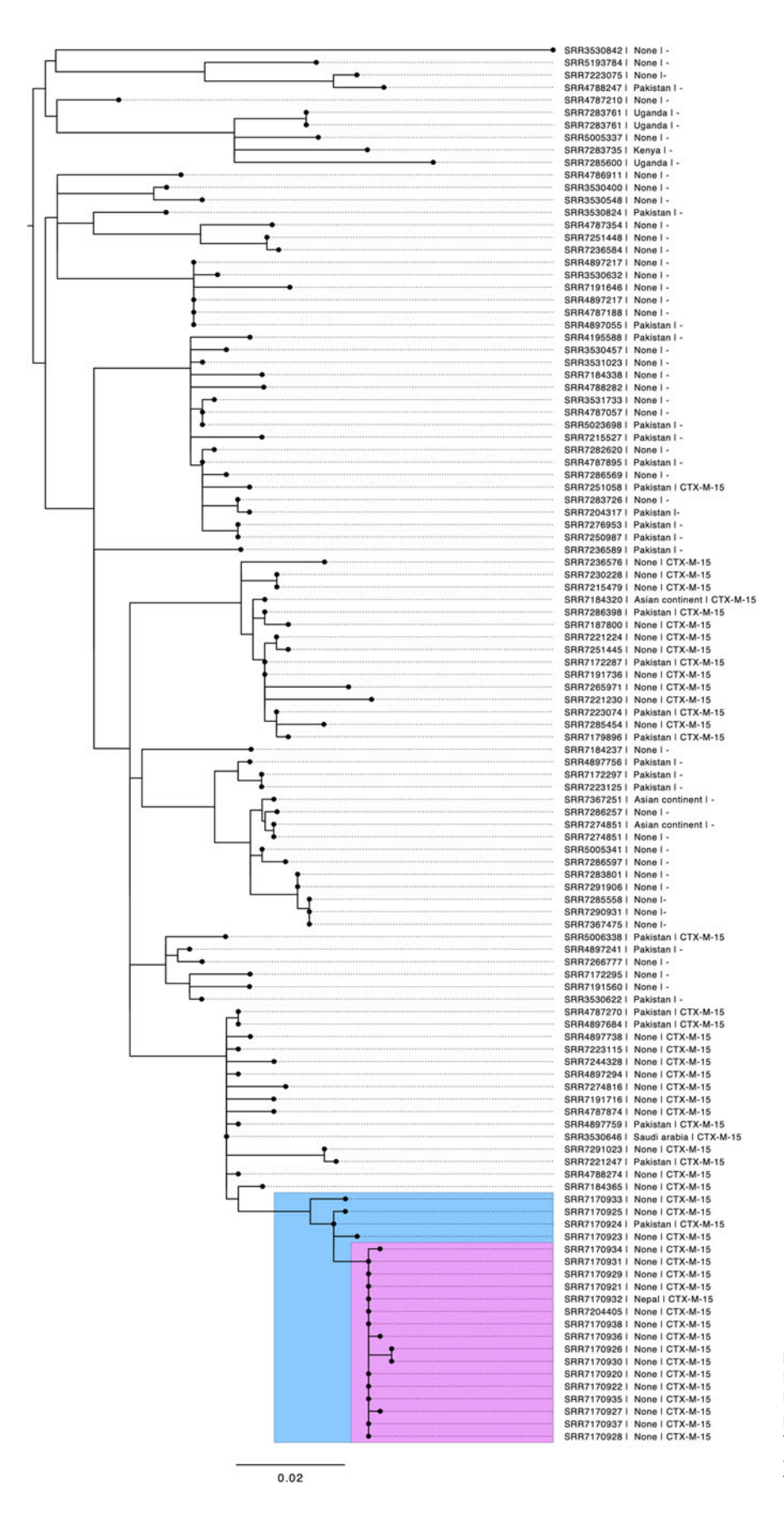
Fig. 3. Phylogenetic tree of S. sonnei at the 25-SNP single linkage cluster. The blue insert highlights the 5-SNP single linkage cluster, including historical cases from 2017. The pink insert highlights cases from 2018 meeting the confirmed case definition. Annotations include the short-read accession number (SRR number), travel destination if stated, and presence of CTX-M-15.