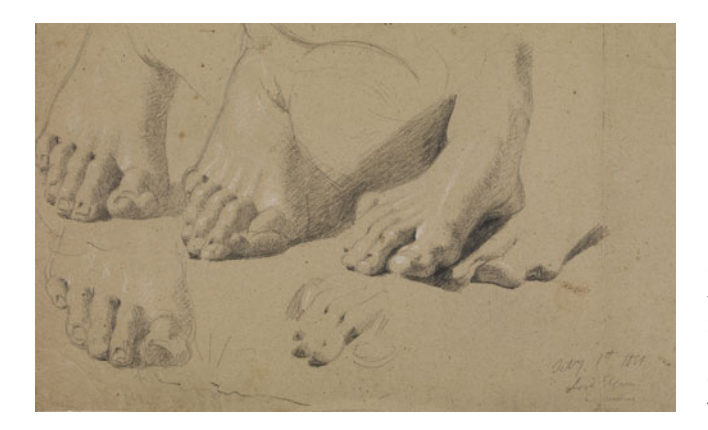
Figure 3. Benjamin R. Haydon, 19 October 1811, black chalk, heightened with white, on brown paper, 251 × 415 mm. The three drawings on the left are studies of feet from the Parthenon sculptures.

seek it, but the painter James Northcote declared it useless. 62 Many Royal Academy students and professors shared the latter's view, but Haydon heeded the former, convinced that the greatness of ancient Greek and Renaissance Italian artists depended on deep knowledge of anatomy.<sup>63</sup> Before he studied the marbles, Haydon had gone a long way to pursue such knowledge. He had procured Bernhard Albinus's Tables of Anatomy (1754) while still in his hometown and 'hugg[ed]' John Bell's The Anatomy of the Human Body (1797) as soon as he arrived in London in 1805.<sup>64</sup> In the Royal Academy library he would have encountered additional anatomical atlases. 65 Focusing on myology and osteology, atlases divided the body into parts, classified the bones and the muscles, pointing out origins and insertions of muscles, offering Haydon information he learned by heart, 'like boys at schools'.66 From their images and from additional ones he produced, Haydon learned to discern anatomical parts better. Several anatomical atlases used an iconography that exaggerated the musculature to render constituent parts more visible.<sup>67</sup> In his own anatomical album Haydon copied many of Albinus's plates, adding his own notes and observations.<sup>68</sup> He also clarified difficult features by numbering anatomical parts, eliminating visual clutter, and even reducing some drawings to diagrams (Figure 4).