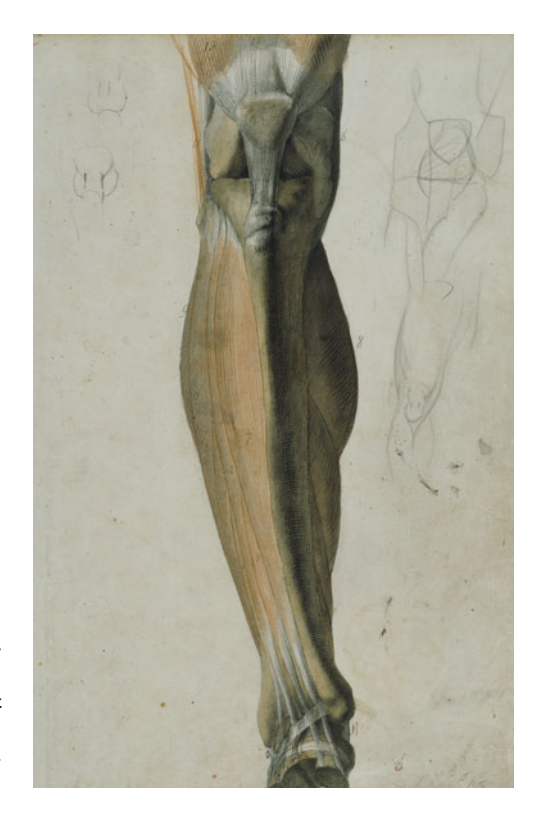
Figure 4. Anatomical drawing of the bones and muscles of the lower leg. Benjamin R. Haydon, anatomical album, 5 June 1805, pen and black ink with red, light brown and grey wash on off-white laid paper, 465 × 302 mm.

Haydon to ascertain the natural boundaries of muscles, tendons and bones. What must have clearly helped him was feeling these parts with his hands – the virtues of tactile examination were extolled by contemporary anatomists, particularly Charles Bell, a surgeon and anatomist whose private course Haydon took in 1806.<sup>70</sup> Apart from matching what he saw on the surface of the body with what lay underneath, Haydon also learned to identify certain parts as anchors of vision. The vertebra prominens was 'literally ... a lighthouse', whereas the 'point of the coccygis and the two processes of the ilium' he found 'excellent guides'.<sup>71</sup> Anatomy instilled a 'spirit of minute observation' and provided an interpretive frame for organizing his perception.<sup>72</sup> It directed attention to the essential detail, enabled him to grasp patterns, and bestowed an ability to see apparently 'unmeaning variations in the outline' of the Elgin Marbles as meaningful parts.<sup>73</sup>