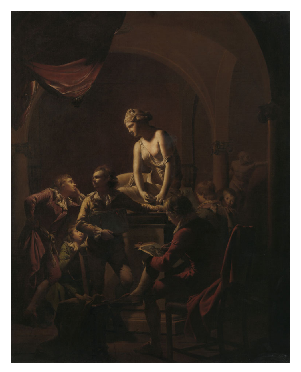
Figure 6. Joseph Wright of Derby (1734–97), An Academy by Lamplight, 1770, oil on canvas, 1270 × 1010 mm. Yale Center for British Art, Paul Mellon Collection, public domain.

but receptive to an almost mystical influence.<sup>134</sup> This was the strongest emotion, but it was also calm. Haydon did not fear, as he had in the past, that he could be wrong. A valuation that had begun as uncertain orientation had now turned into an intense and stable emotion that knew that the marbles were the finest on earth. And Haydon would