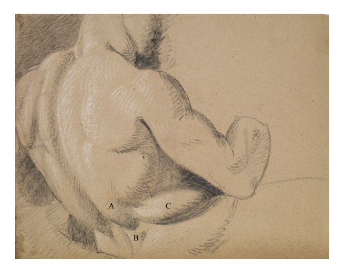
Figure 2. Study of the Theseus from the Parthenon sculptures, Benjamin R. Haydon, sketchbook, black chalk heightened with white on brown paper, 413 × 524 mm. The parts indicated are (A) latissimus dorsi, (B) thoracolumbar fascia and (C) external abdominal oblique.

salient contours.<sup>55</sup> Other times, he would move his 'solitary candle about, above, and underneath' the marbles to make some features prominent by the shadow they cast.<sup>56</sup>