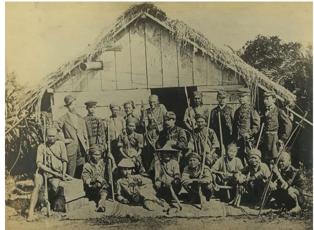
Figure 3: Soldiers of the Japanese expedition under Commander-in-chief Saigō Jūdō (西郷 従道 1843–1902), pictured with leaders of Segalu (Native tribe of Taiwan), 1874 @ Yasukuni Shrine archives.

Japan's process of modernization was accompanied by the adoption of these ideologies and practices, driving Japan's leaders to establish their nation-state, the imagined community of "Japan," and to follow the racial discourse dominating the political sphere, with a small twist: although Japan had been grouped with other Asian nations in the prevailing discourses of race, it nevertheless strove to associate itself with the white, European/Western race. Leaders and ideologists, for example, assigned inferior racial attributes to the different groups and ethnicities on or around the Japanese islands, gradually pulling Japan away from Asia, and closer to Europe. The Meiji era (1868–1912), therefore, saw Japan's passage into modernity and identification as a modern state first within its own boundaries, and then, in terms of broader affiliations and international relations, Japan's efforts to associate itself with Euro-American processes, developments and racial discourses, simultaneously distancing itself from Asia in general, China (and Korea), in