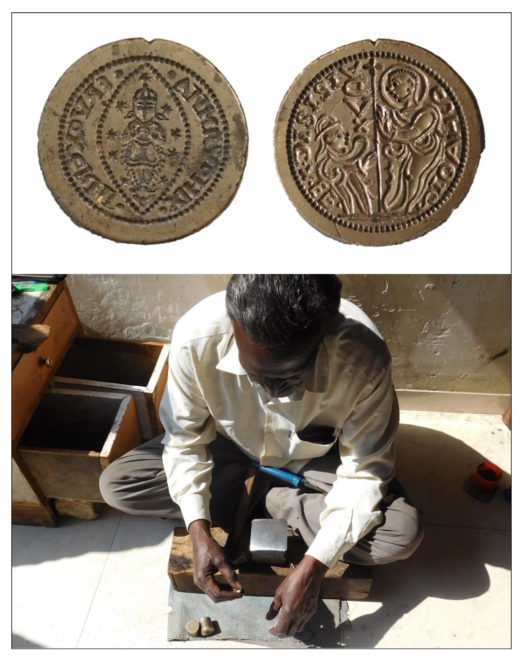
Figure 4. Top) hand-made dies; bottom) the striking of putali.

as depictions of Radha and Krishna dancing garba dance, and on some of the dies they are identified by an inscription.