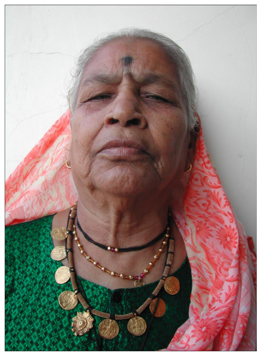
Figure 3. Indian woman wearing putali haar (© Indian Numismatic, Historical and Cultural Research Foundation, Nashik, India).