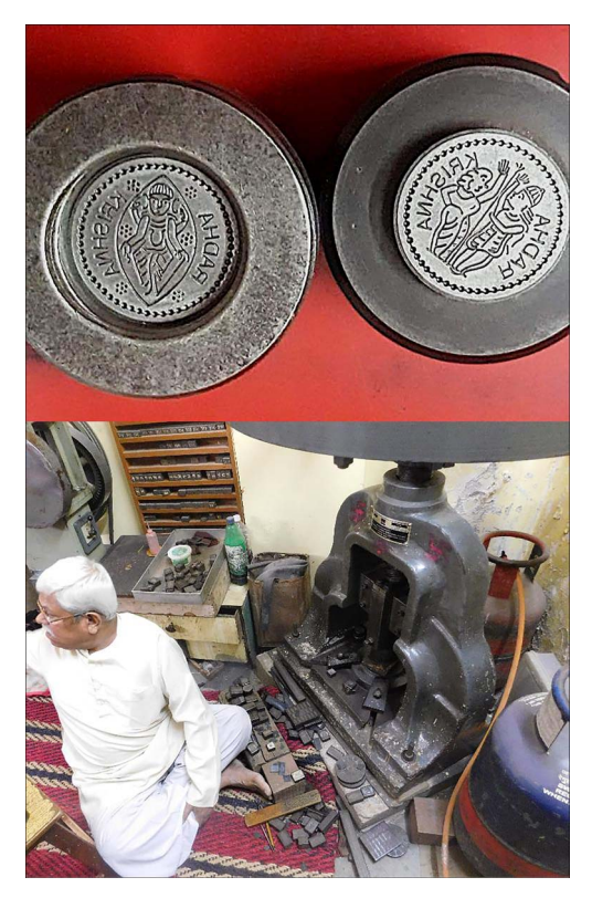
Figure 5. Top) machine-made dies; bottom) a press.

2008: 67). In South India, putalis are called sanar kasu . Here, the figure of the Doge is interpreted as a representation of sanar (a toddy—or palm wine —drawer) preparing to climb the palmyra (palm) tree (Aravamuthan 1999: 6–8). According to another interpretation, the name sanar kasu refers to the fact that, while drinking toddy, the person often sits on his haunches next to the tapper, who is pouring toddy into the bowl, which the drinker holds aloft. This position strongly resembled the figures of St Mark and the kneeling Doge (Bakar & Bhandare 2009: 26).