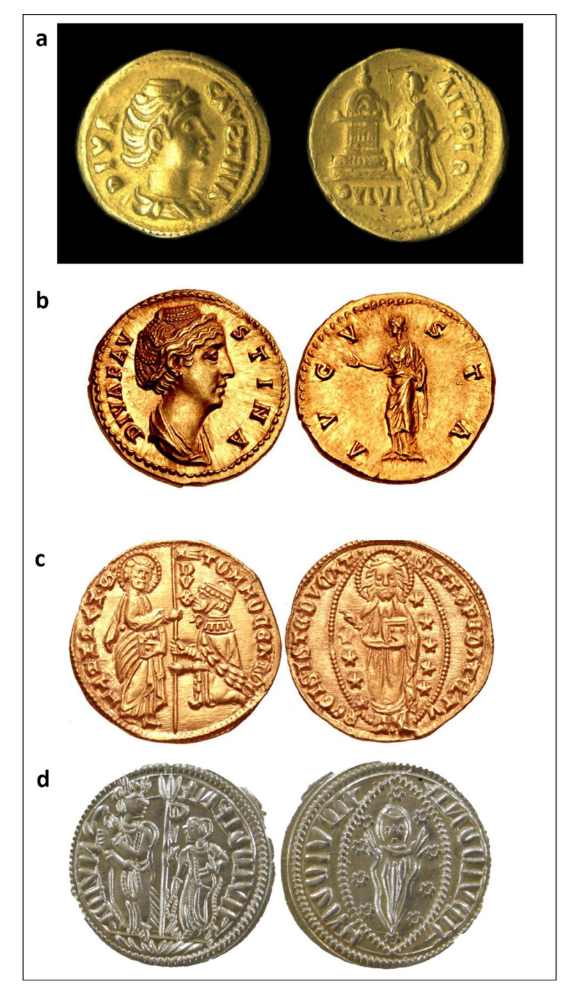
Figure 2. a) Indian imitation of aureus (BM number 1988,0808.11); b) its prototype (Antoninus Pius, RIC III 367); c) ducat of Tommaso Mocenigo (1413–1423); d) Indian putali (K.K. Maheshwari's private collection).