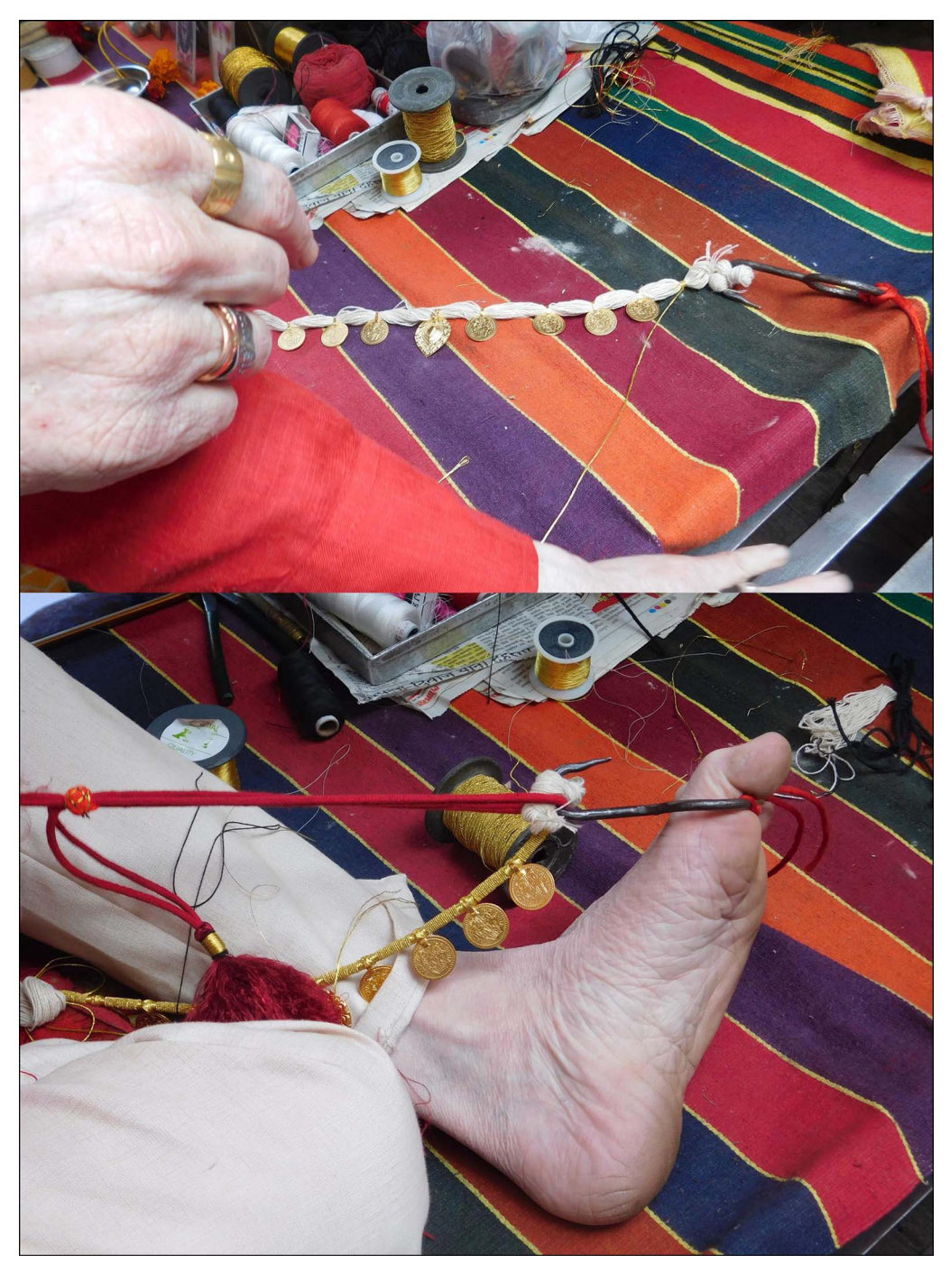
Figure 6. Making a haar (photographs by E. Smagur).