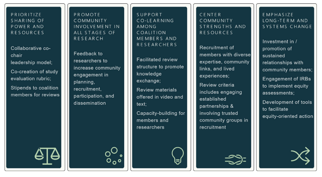
Fig. 1. Community-engaged research values aligned with core activities of the Community Coalition for Equity in Research.