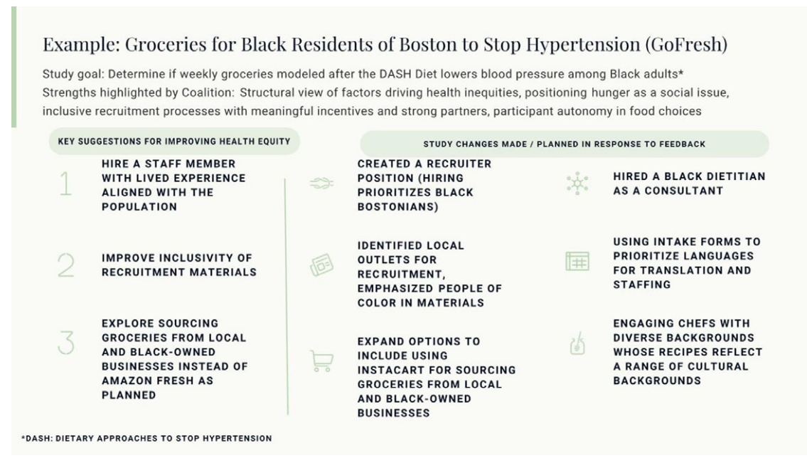
Fig. 3. A case example of recommendations made by the coalition, and the changes made to the study procedures.