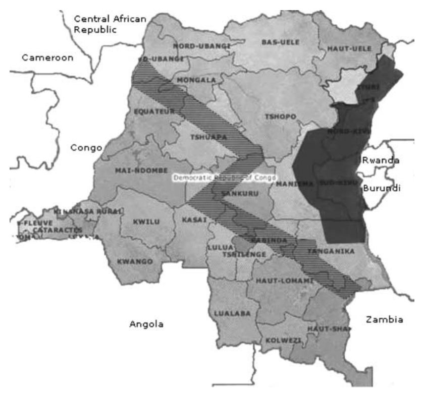
Fig. 1 Map of Democratic Republic of Congo, showing geographical priorities of the European Commission Humanitarian Office<sup>4</sup>. ■, unstable regions still suffering from conflict or emerging from recent conflict – Ituri and Grand Kivu ('red zone'); ■, regions where intense fighting took place between 1998 and 2001, and which began to stabilise in 2002 – Équateur, Kasaï and Katanga ('blue zone')

The experts visited 12 out of 19 health projects. Data from hospitals showed that, in DRC, malaria is the main contributor to the mortality rate and is responsible for about half of childhood deaths (52% in 2003); acute respiratory tract infections, diarrhoea