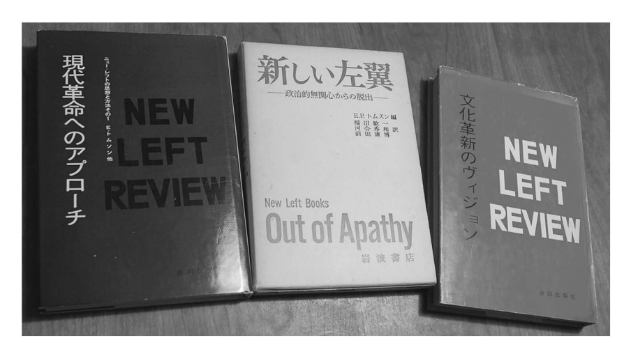
Figure 2. Japanese translations of the selected collections of New Left Review articles and Out of Apathy.

and Yasuhiro Maeda, although there were no follow-up comments, criticism, or discussion.<sup>32</sup>