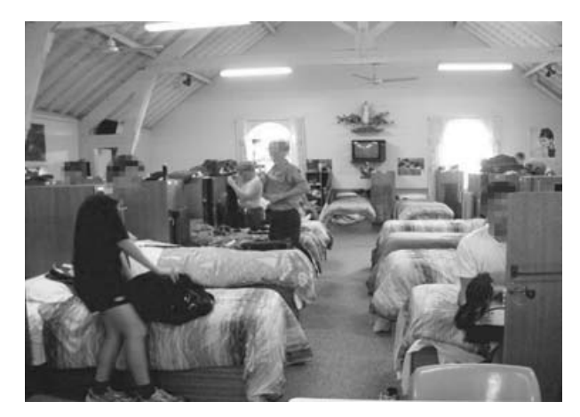
Fig. 1. One of the affected dormitories.

IgG GMC of the symptomatic and asymptomatic groups. Wilcoxon matched-pairs signed rank sum was used to test the statistical significance of differences in PT IgG GMCs between paired serum samples.