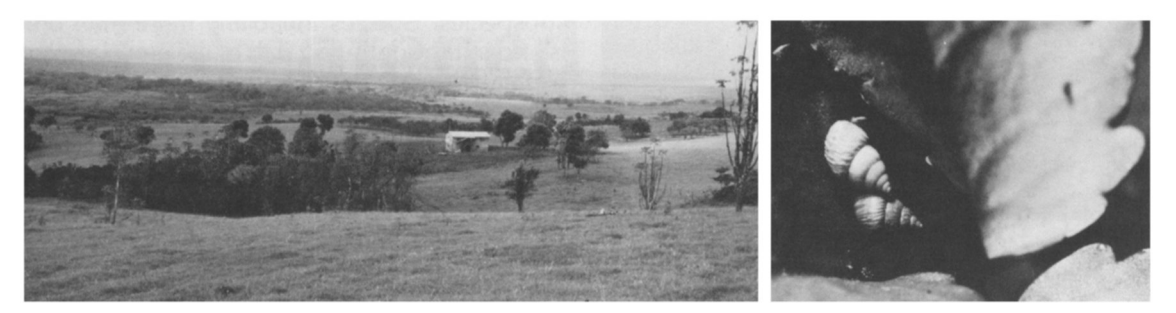
Left: The southern slopes of Santa Cruz, where pasture and cultivations have replaced the endemic Scalesia forests.

Right: Bulimulus tortuganus at 300 m on Sierra Negra, Isabela. Many populations of this species were wiped out by the catastrophic fire that raged on Isabela from late February to June 1985 and devastated part of the volcano's southern slope.