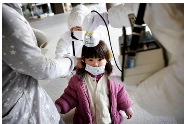
Young hibakusha in Hiroshima suffering from radiation sickness photographed at the ABCC

In 1966 a US nuclear bomber blew up in midair and the debris fell on the small village of Palomares, Spain. Four H-bombs fell from the plane, one into the sea, and three onto the small village. None exploded but two broke open and contaminated part of the town with plutonium and other radionuclides. To this day