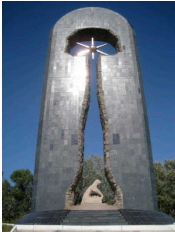
The memorial "Stronger than Death" in Semey, Kazakhstan

Conclusion —Radiation makes people invisible. It makes them second class citizens who no longer have the expectation of being treated with dignity by their government, by those overseeing nuclear facilities near them, by the military and nuclear industry engaged in practices that expose people to radiation, and often by their new neighbors when they become refugees. People exposed to radiation often lose their homes, at times permanently, either through forced removal or through contamination that makes living in them dangerous. They lose their livelihoods, their diets, their communities, and their traditions. They can lose the knowledge base that connects them to their land and insures their wellbeing.