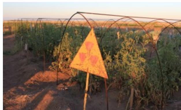
"Temporary housing" for those evacuated from Bikini Atoll (left) and Fukushima (center)