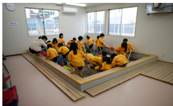
Fukushima school children play in an indoor sandbox

In Fukushima Prefecture the Japanese government proclaimed a 20km mandatory evacuation zone, while also designating a "suggested" evacuation zone from 20km to 30km. These zones do not directly reflect the dangers from radiation levels. In some of the mandatory evacuation areas the gamma levels are below those in parts of the suggested evacuation areas. Some areas where the plumes came down 50-80km away have even higher levels. The limits to mandatory evacuation areas reflect efforts to limit the direct liability of the government. Even today children live in areas where the radiation levels are too high for them to be allowed to play or spend significant time outdoors. 5