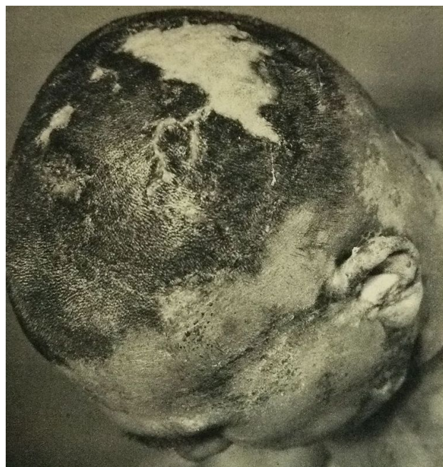
A child from Rongelap showing health effects from radiation exposure after Bravo