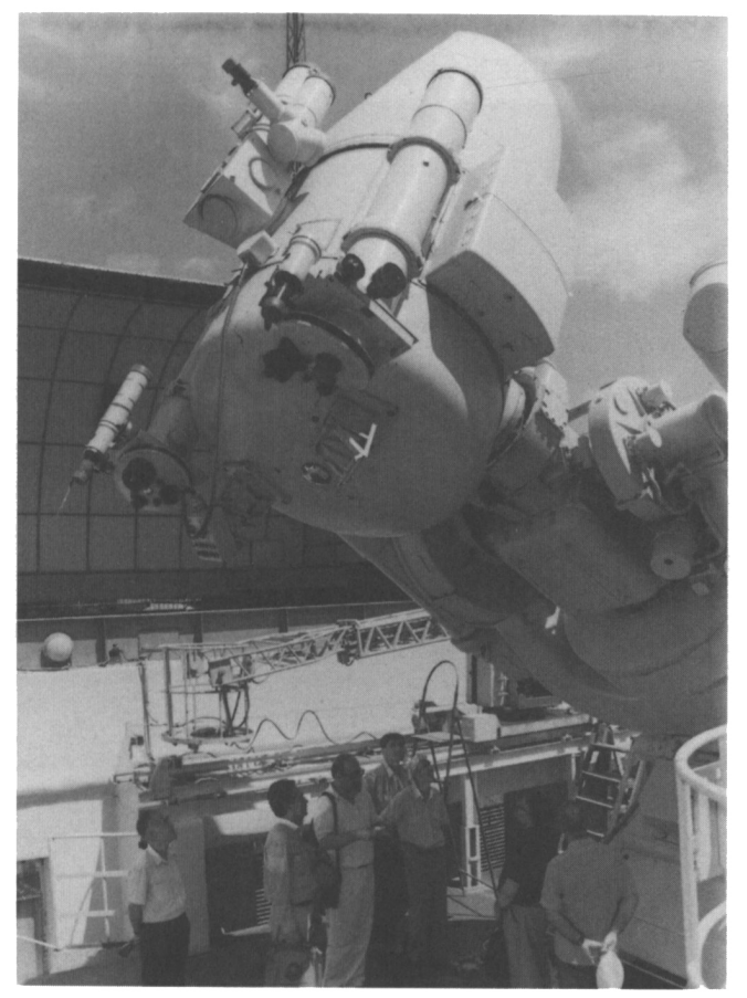
Figure 1. Gissar Observatory: The 1-m astronomical camera