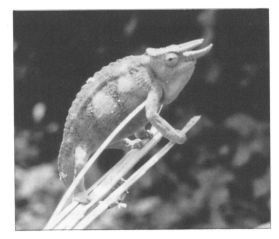
The Rwenzori three-horned chameleon Chamaeleo johnstoni is endemic to the Albertine Rift Afromontane Region. The recent creation of three mountain forest parks in Uganda greatly improves the long-term survival prospects for much of Uganda's biodiversity.