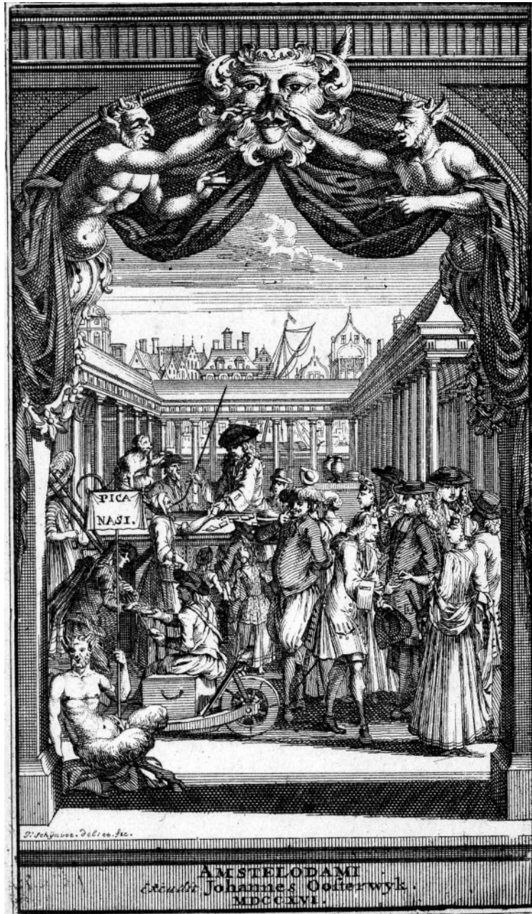
Figure 2: Frontispiece to Johann Cohausen, Dissertatio satyrica physico-medico-moralis de pica nasi, sive tabaci sternutatorii , Amsterdam, J Oosterwyk, 1760. Even the ornament decorating the top of the arch is taking snuff.