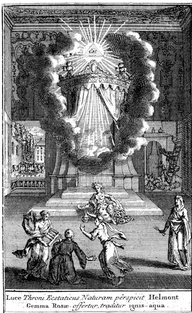
Figure 5: Frontispiece to Cohausen's Helmontius ecstaticus , Amsterdam, Salomon Schouten, 1731. The figure with the open book proffers the gemma rosae or philosophers' stone to van Helmont, while the other gives him the flask with the ignis-aquae or alkahest. In the background we see a fountain of water to the left, and the fires of the alchemical laboratory to the right. The figure on the left represents the kneeling van Helmont with the "clavis" or key to alchemical wisdom. "Est" or "it is", the revealed light of God's wisdom, and nature, crowned with laurels and in a garment covered with alchemical symbols, lies resplendent on the steps of the altar.