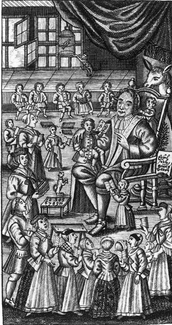
Figure 4: Frontispiece to Cohausen's Der wieder lebende Hermippus , Sorau, 1753. A youthful-looking Hermippus is surrounded by children learning their lessons.

The Hermippus was a commercial success, mentioned by the Journal des Scavans , and translated into English in 1743 by John Campbell (1708–75), a Scottish historian and political writer. Campbell's text was re-translated into French by Monsieur de la Place in 1789, and "it is this that is known and considered by many people as the work of the German physician"; some later readers even thought that Campbell had written the